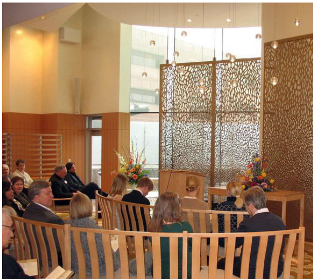
Interfaith Chapel at Children's Mercy Hospital, Kansas City