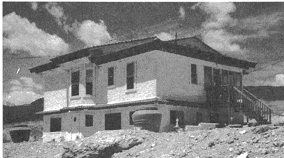
The Church's Production Department now operates in the upper level of the this building at the Steamboat Priory-Mission. The lower story houses The Church's tape duplicating facilities.

Foundation representatives returned to Reno on Saturday, June 3rd. ◆