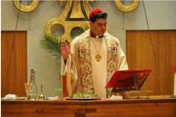
Pannuches Meal Rite

The 57 th Pannuches Meal Rite was held Saturday, August 7, 2010. Jubilee Sunrise Service was held the following morning in Sanctuary.