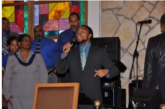
Members of the Second Baptist Church Choir perform at the 2012 MLK Jr. celebration.