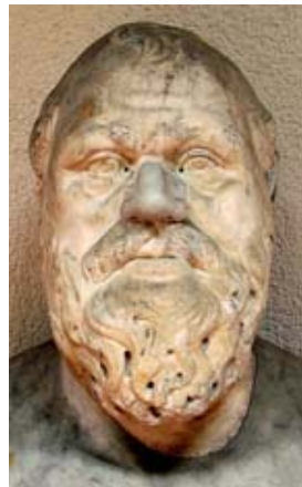
Socrates portrait by Palermo copied from the 4th- century original