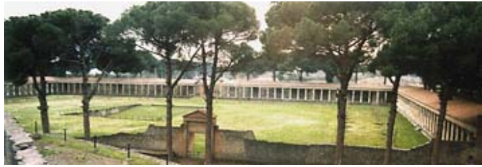
Pompeii gymnasium seen from the top of the stadium wall