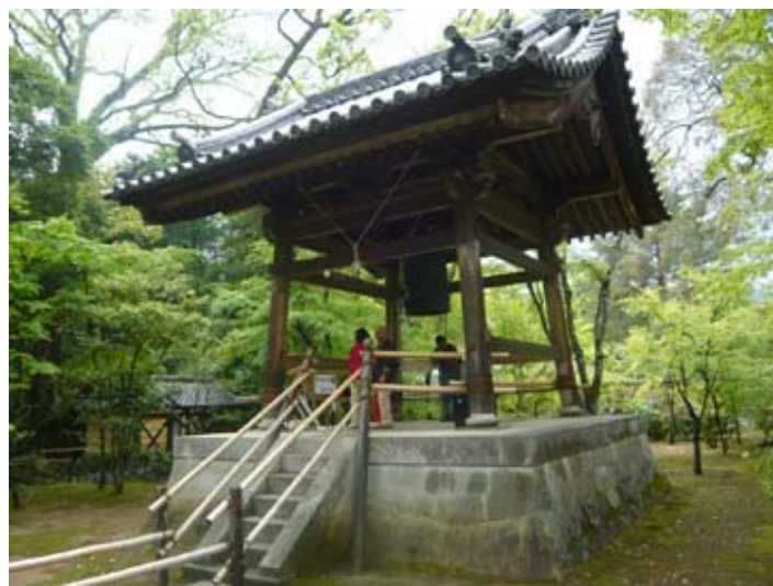
Outside Gokuraku-ji Temple in Naruto City.