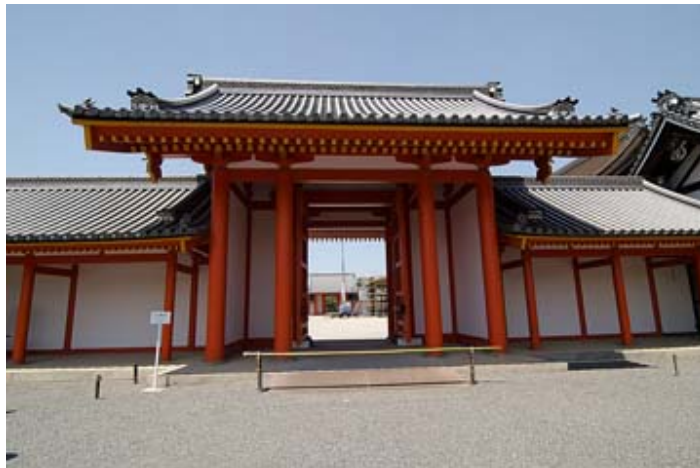
Imperial Palace, Kyoto.

Kyoto Imperial Palace (Kyoto Gosho) is an imperial palace of Japan, although the emperor of Japan has not been in residence there since 1869. The palace is situated in a rectangular enclosure that contains gardens and numerous imperial halls and residences. The palace has been destroyed and rebuilt eight times; the version currently standing was completed in