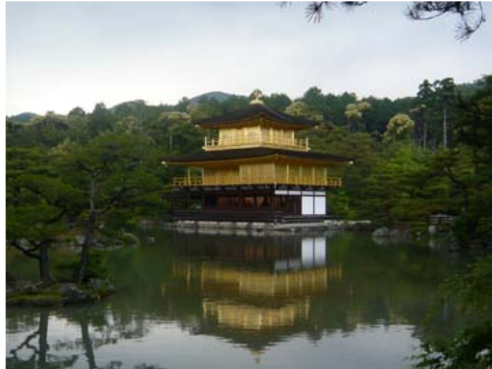
Golden Pavilion.