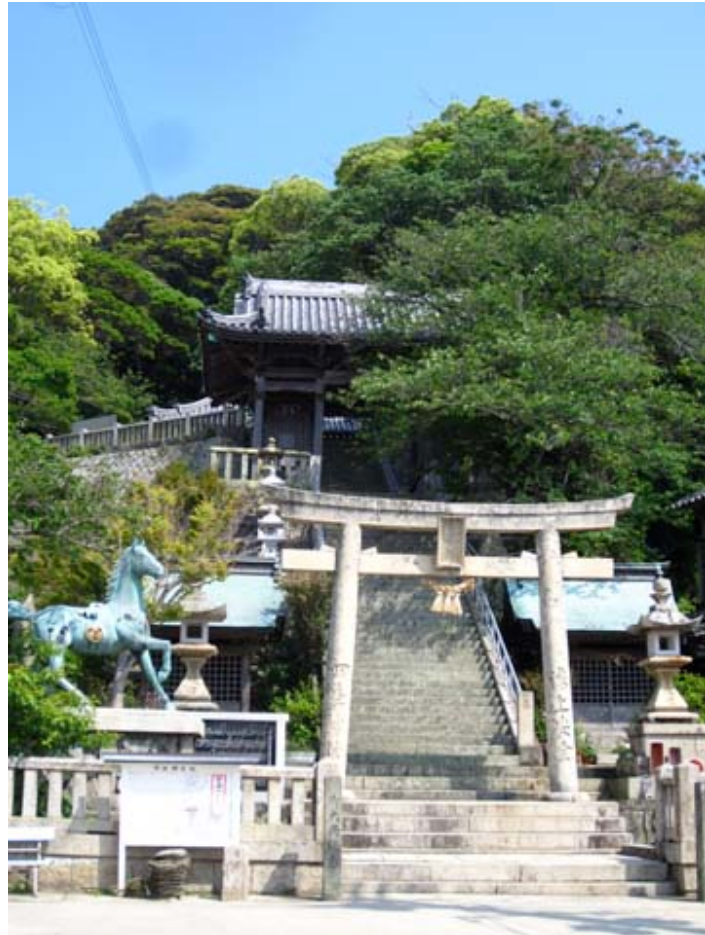
Waterfront shrine on Nu-shima Island.