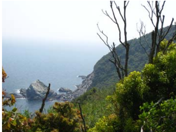
On the hiking trail on Nu-shima Island.