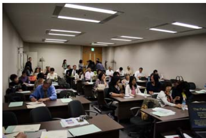
Audience filling the lecture room in Kyoto.