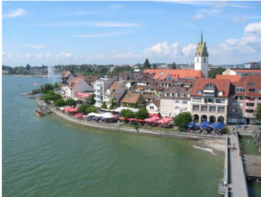
Konstanz on the Lake, site of the Emergence 2012 Conference in October