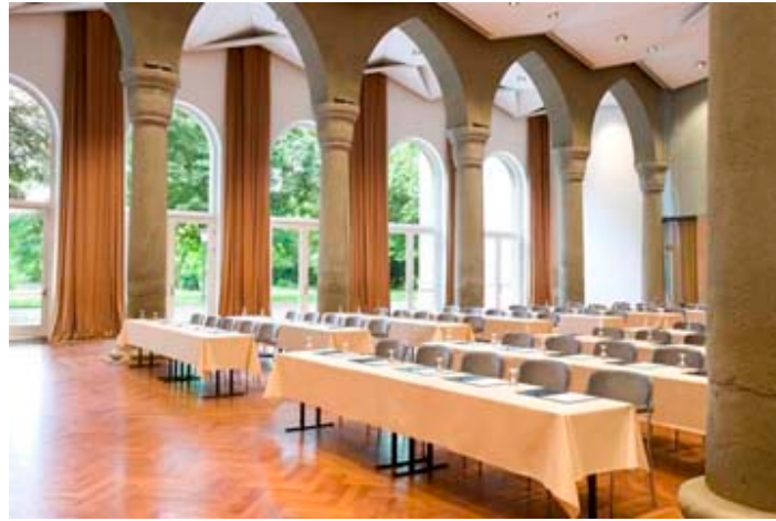
The Festsaal Room where the conference will be held