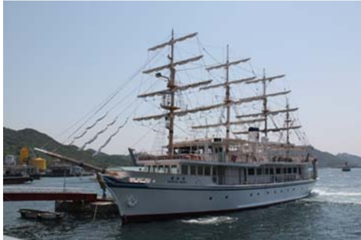
Tour ship.