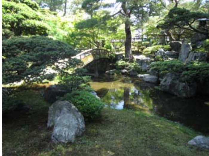
Garden at the old Imperial Palace in Kyoto.

1855 and attempts to reproduce the original Heian Period architecture.