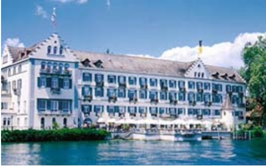
The Steigeneberger Hotel

The venue for the conference is the Steigenberger Inselhotel Konstanz. The conference gathering will open on Friday October 12, with a Zeppelin ride over the Alps and Lake Konstanz with the presenters, with a presenters' reception and evening dinner following.