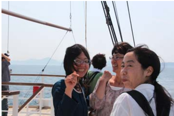
Tour members aboard ship.