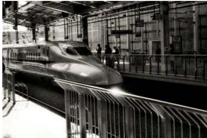
Bullet train in Kyoto Station.

Visit Jim Elliott's public gallery of Kyoto Station photos .