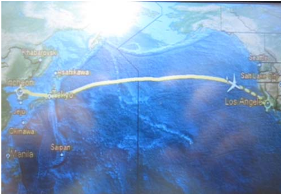
Japan-U.S. air route on the screen in the aircraft on the way to Los Angeles.

Breakfast at hotel. Transfer to airport today for your afternoon flight back to the U.S. via Seoul, Korea. One group returns to U.S.A. immediately. Another group remains in Seoul for extended tour.