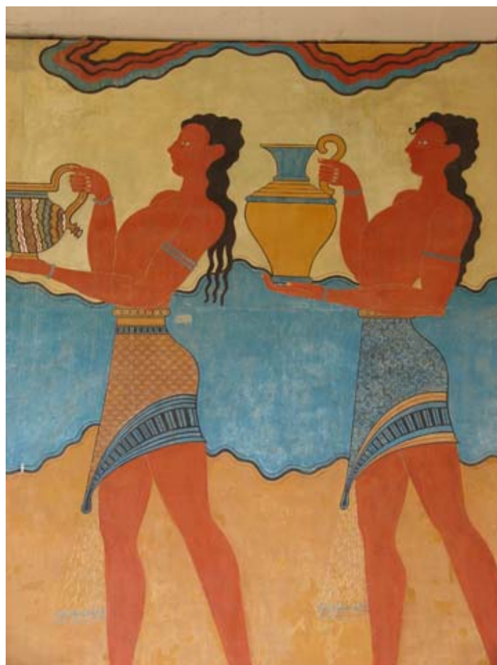
Reproduction from the Palace of Knossos.

Solar Teachings of Greece and the Mediterranean , the ninth in a series of Project X Symposia lectures on ancient solar cultures, has now been published and is being made available to Consociates enrolled in or graduates of the Academy Program who wish to obtain a personal copy.