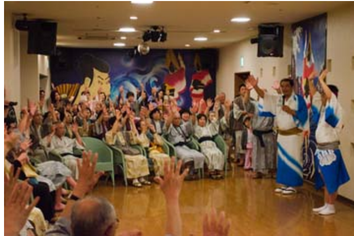
Dance performance at Renaissance Resort, Naruto.

After dinner on this evening there is a performance of Japanese dance: "Awa odori," the Dance of Fools. Awa Odori is the largest dance festival in Japan. The heart of the tradition lies about ten miles away in Tokushima City and is usually held August 12-15.