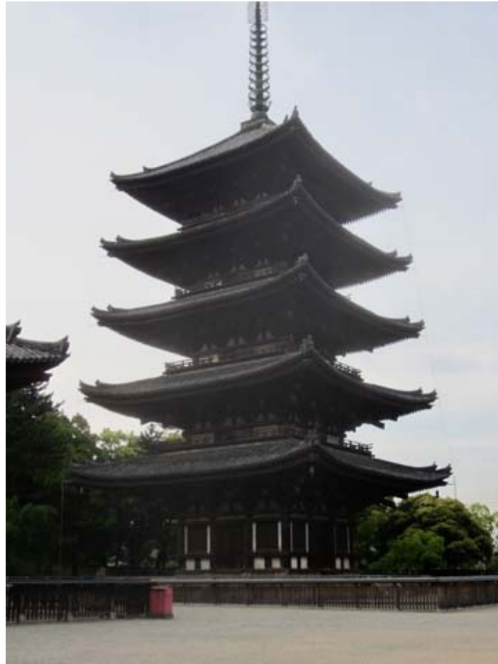
The unique five-storied pagoda is the tallest wooden tower in Japan.

The entire city of Nara is a protected preserve for deer. Deer are everywhere, roaming the streets, filling the parks, and children and tourists are everywhere petting and feeding them.