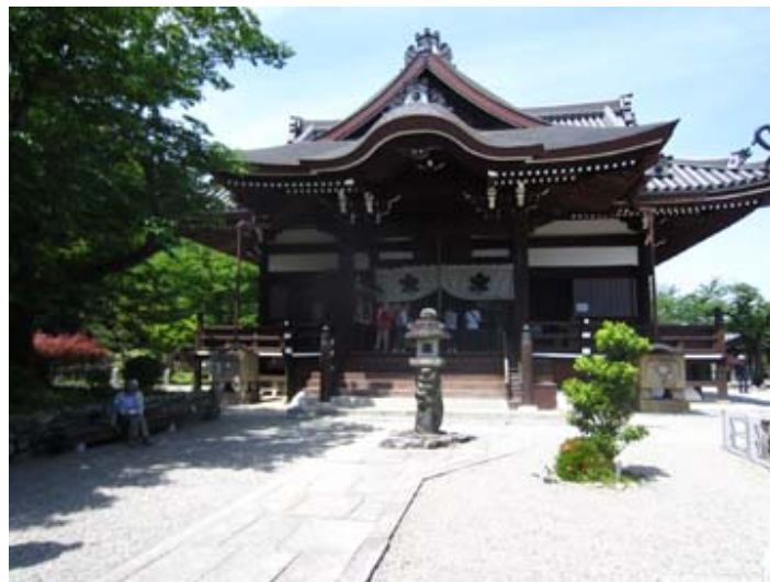
Tachibana Temple.

Among the many temples located in this area is Tachibana Temple, where Prince Shotoku (574-622 CE) was said to have been born in a manger like Jesus; one of seven major temples built by Shotoku.