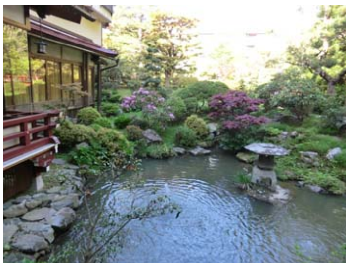
Sekisho-in Temple garden.