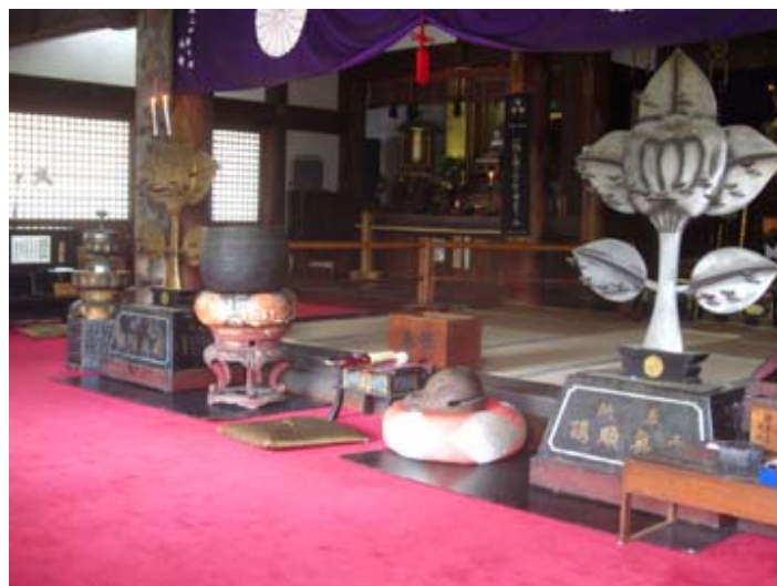
Tachibana Temple interior shrine.