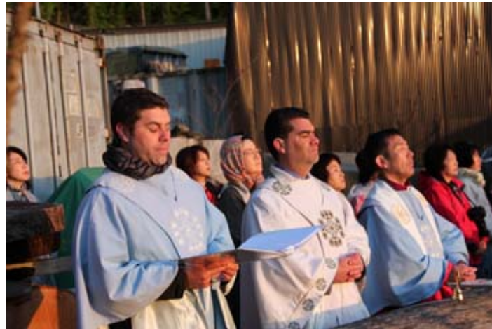
Sunrise Divine Service on Mt. Koya.