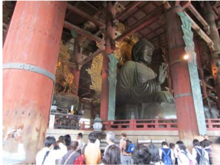
Todai-ji Temple interior with seated Buddha.

“Heijo-Kyo, the ‘Citadel of Peace,’ is amazingly BIG! It is the largest wooden building in the world – with tens of thousands of visitors daily. The largest statue of Buddha in the world is inside.”