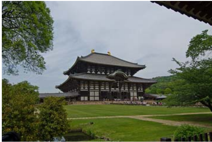
Exterior view of Todai-ji Temple in Nara.