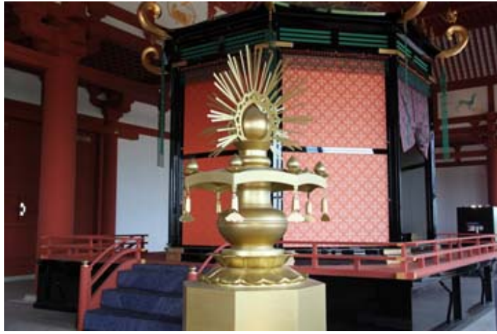
Interior of the building pictured above showing sunburst figure.