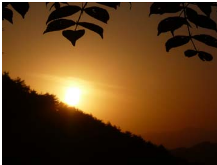
Sunrise on Mt. Koya.

"Shortly after 5:00 AM the sun makes its way up through the trees on the horizon.