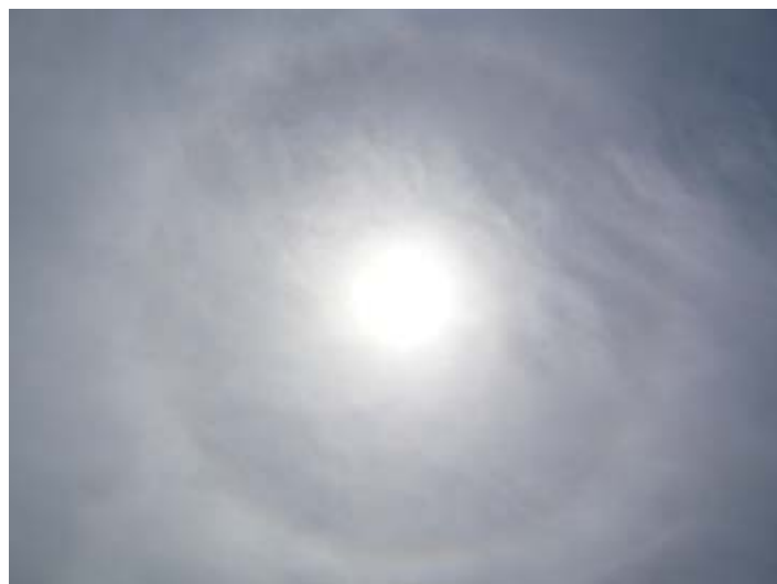
Sun over Heijo-Kyo.