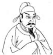
Emperor Wu - tsung (Wuzong)

Under Emperor Wu-tsung (reigned 840–847) the dynasty had gone through a period of crisis. After the Uighur Empire fell and internal strife in Tibet destroyed all semblance of central power there, Chinese authority once again spread into the