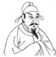
Emperor Wu-tsung (Wuzong)

Two dynastic generations after the Monument was raised, a period of time shorter than a single lifetime, the monasteries suffered the humiliation of mortal dissolution, as had the benefactor Mar Iazed-buzid before them. (See Supplement 32) In 845, the monastery buildings were confiscated by imperial decree; the monks were returned to secular life so they might pay taxes ; and the Stone was buried in the earth, where it remained for nearly 800 years. (See Supplement 33)