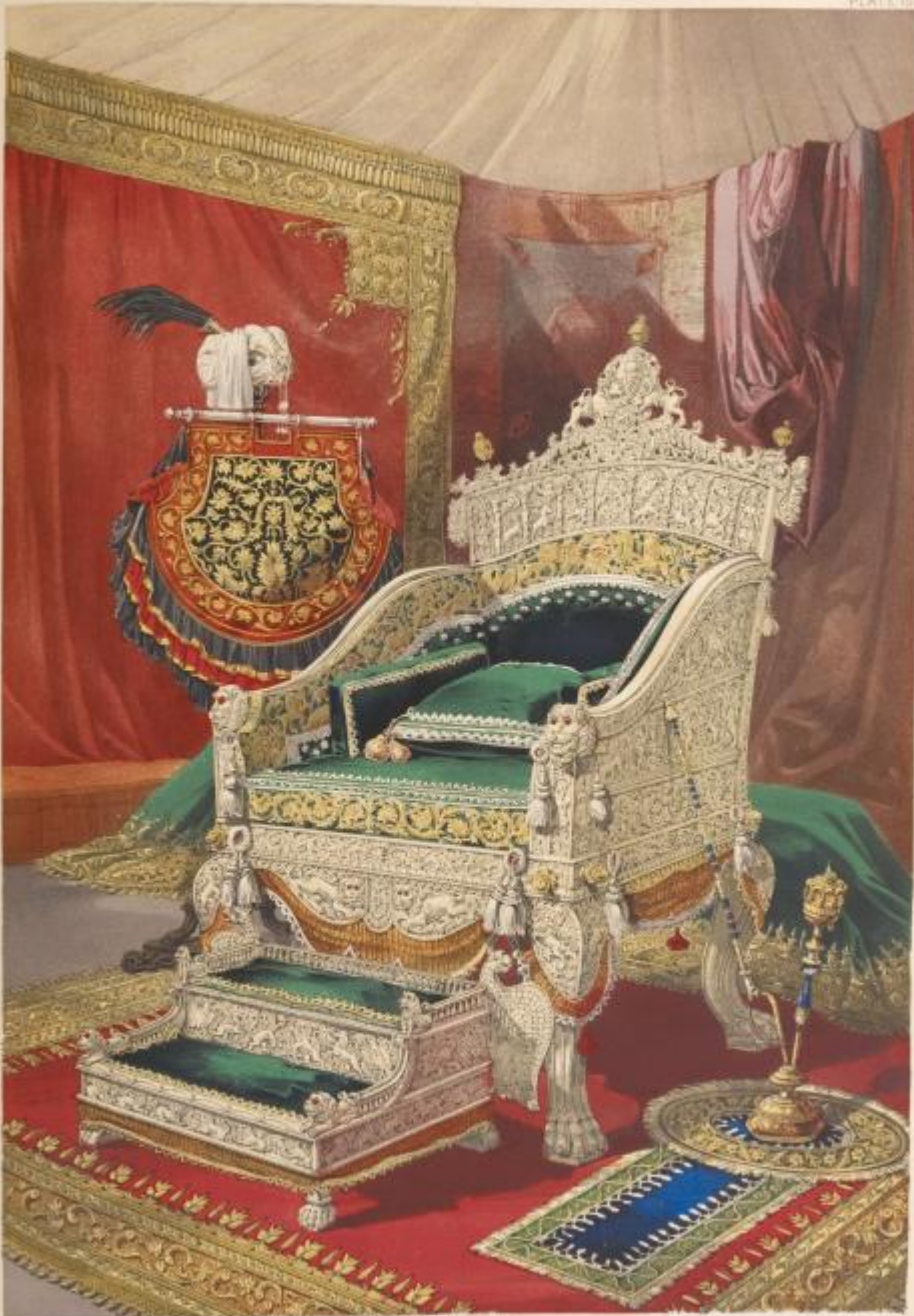
IVORY THRONE AND FOOTSTOOL, PRESENTED TO HER MAJESTY THE QUEEN, BY HIS HIGHNESS THE RAJAH OF TRAVANCORE.

W. & A. GILBERT, 11, PATERNOSTER ROW, LONDON. PRINTED AND PUBLISHED BY W. & A. GILBERT, 11, PATERNOSTER ROW, LONDON.