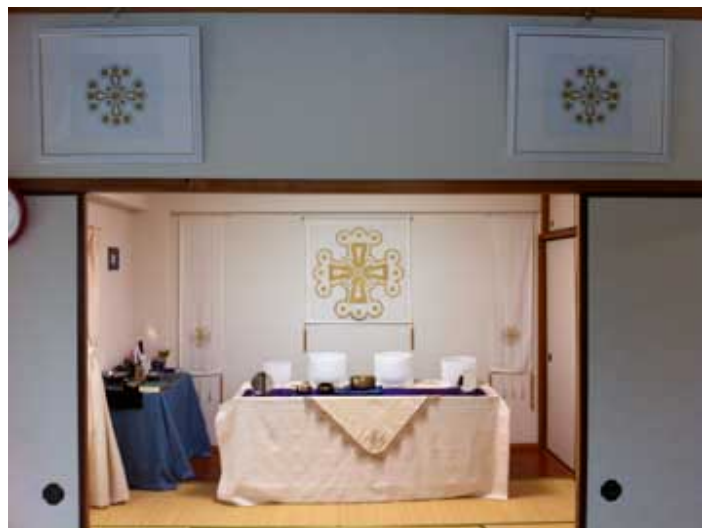
A view of the Cosolargy Center in Japan.

After that, we began to play the singing bowls together. Enjoying the sound of Loving energy that we each created and transferred as we played. It was fabulous.