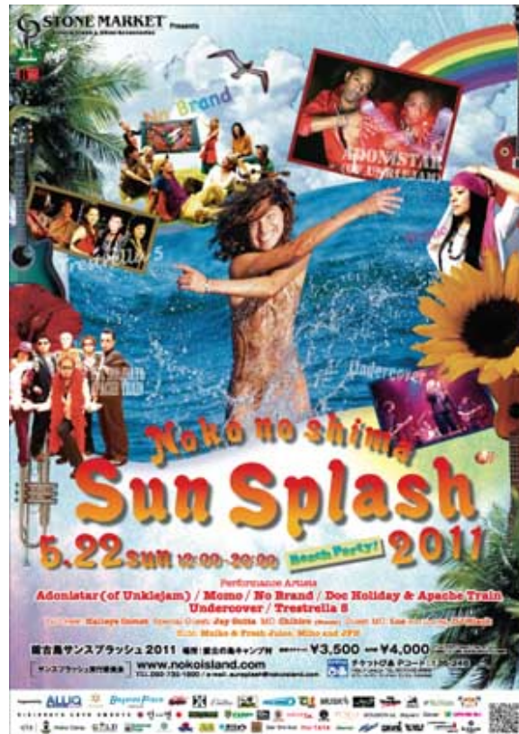
Poster for the Sun Splash Festival in Japan where Adonistar (pictured upper right) was headlining the show.

festival in Fukuoka (on mainland Japan) on 22 May 2011. I then found out that the Japan Cosolargy Center was in Kurume, which is a 30- to 40-minute drive from Fukuoka! “Wow!” I thought, how amazing is that!” The moment I decide to go back to work, I’ll have a paid flight, accommodations, and get paid a wage, all while being inches away from the destination that I wanted to visit most. This for me was nothing short of amazing.