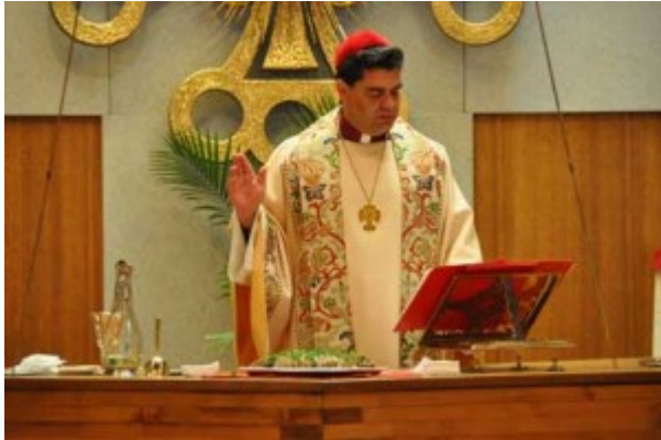
Pannuches Meal Rite

The 57 th Pannuches Meal Rite was held Saturday, August 7, 2010. Jubilee Sunrise Service was held the following morning in Sanctuary.