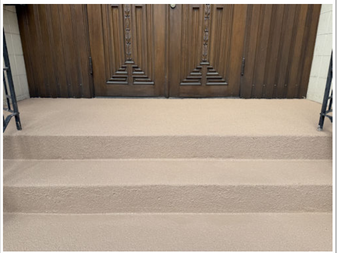
Chancellery front steps (before repair)