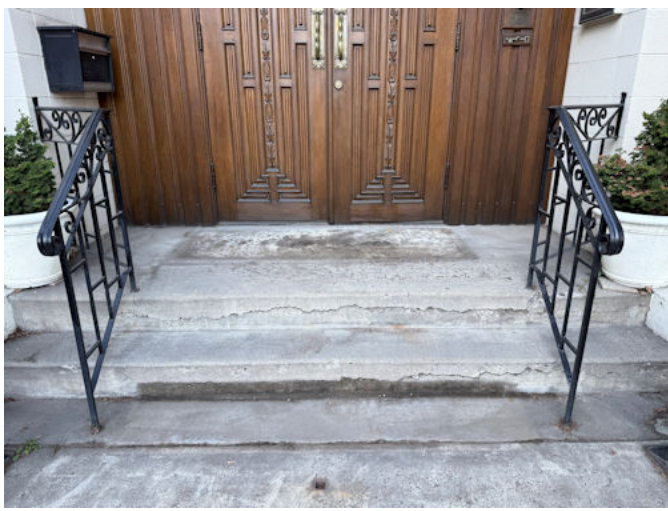
Chancellery front steps (before repair)