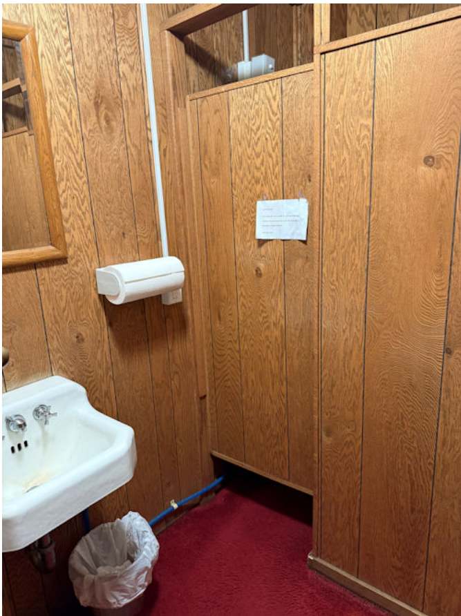
Chancellery Men's Washroom