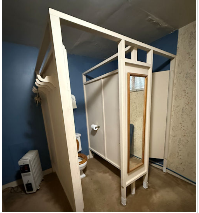
Chancellery Washroom Ladies