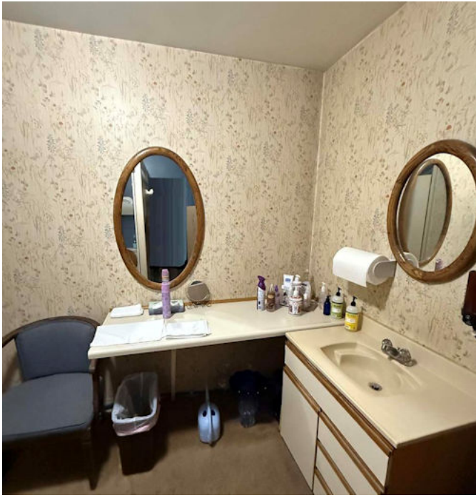
Chancellery Washroom Ladies