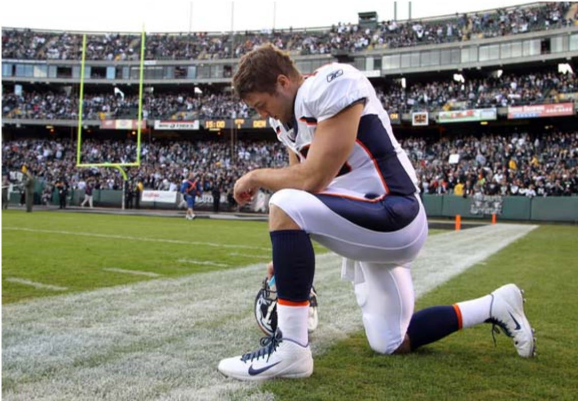
OAKLAND, CA – NOVEMBER 06: Tim Tebow #15 of the Denver Broncos prays before their game against the Oakland Raiders at O.co Coliseum on November 6, 2011 in Oakland, California.

“When those who have acquired moral stability and contemplative knowledge employ these for the sake of human glory, merely conveying an outward impression of the virtues, and uttering words of wisdom and knowledge without performing the corresponding actions; and when in addition they display to others their vanity because of this supposed virtue and knowledge, then they are rightly handed over to commensurate