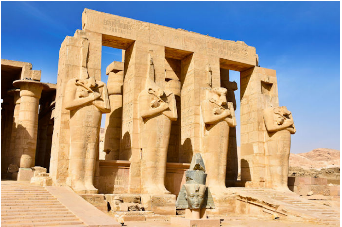
Ramesseum – Egypt Tours Portal

“In the old books, it is said that the Old Motherland was ruled by the Queen of Light, who was supreme above all. The temple tales tell that the lesser gods came to dwell among mortals when the Mistress of Brightness ruled in Kelathi, that they were sheltered in temples, and priests were appointed to minister unto them. It is said that places of instruction were setup within the temples, but few men were taught the inner knowledge. It was rightly held that it would be a danger to those without wisdom, and it had