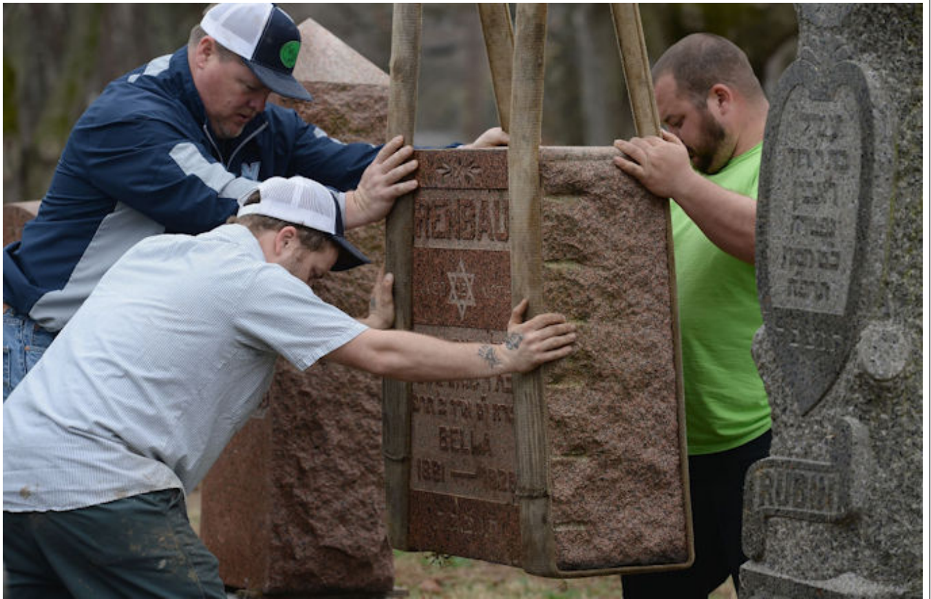
Returning a headstone for a Jewish person that had been torn down by vandals.

“I have never failed to come to the aid of the poor and lowly. I have ever obeyed the laws of God and Man. Goodness has always been honored in my heart, and I have consistently read the sacred writings. Yet never have I found these things consistent with mortal wellbeing. Because my tongue did not turn around corners and twist back on itself, because the words I spoke came from my heart, undiluted with any malicious thought, because I chided the rich for their selfishness and inconsideration, their wasteful living and meaningless activities, they became my enemies. Because I called upon the powerful to live according to the laws they professed to uphold and the words declared to be sacred, I was seized and imprisoned. When I protested the injustice to the ears of the people, I was beaten with rods, I was branded as one who seeks to destroy the stability of the land. I, who tried to set an example of goodness, to lead a life dedicated