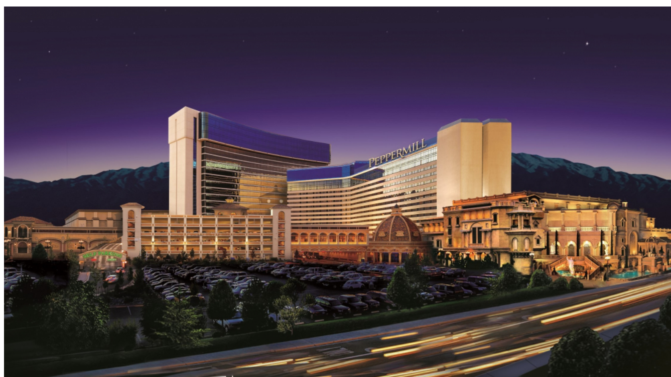
Reno's Peppermill Resort

The 2023 Geothermal Rising Conference will be held in Reno, Nevada October 1st through October 4th with some pre-conference events starting on September 29th. The event will be held at the Peppermill Resort Spa Casino. A tour of our Steamboat Springs Healing Center & Spa will be offered to the group by Steamboat. Here are the details: