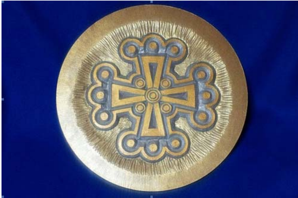
Japanese-style Second Advent Cross

“As the portrait painter keeps an eye upon the king’s face as he draws, and when the king’s face is toward him, he draws the portrait easily, but when the king turns his face away, he cannot draw. In like manner, Christ, the good artist to those who believe in him and gaze continually at him, straightaway portrays after his own image a heavenly person. Out of his own spirit, out of the substance of Light itself, the ineffable Light, he paints a heavenly image. If a person does not gaze constantly at Christ, the Lord will not paint his image with His own Light. We must, therefore, gaze upon him, believing him and loving him, throwing away all else and attending to him in order that he may paint His own heavenly Image and send it into our souls, and thus, wearing Christ, we may receive eternal life, and have full assurance and be at rest.