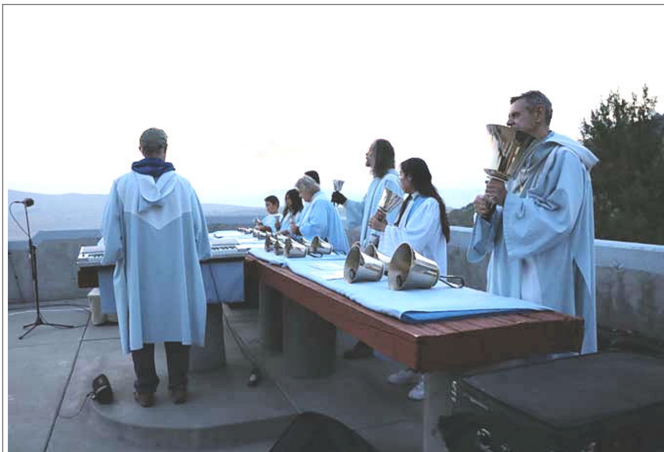
The Jamilian Bell Choir during Divine Sunrise Service.

Following the tour of the museum, a buffet style Banquet was held at Bishopstead.