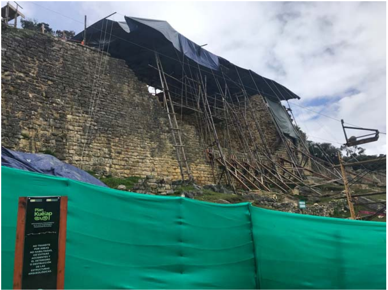
Restoration work underway at Kuelap Fortress

The next major site is Kuelap, and that's why a magnificent cable car system going up there has been built.