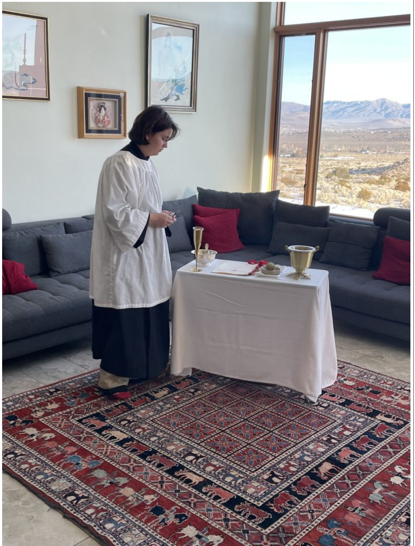
Preparing for the Blessing of the Children 1