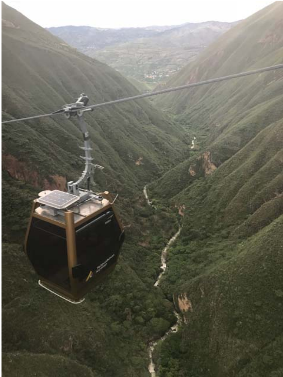
New cable car crossing the mountain valley below

ED: Where did the idea come from to do explorations in the corporate sense rather than going in to do archaeological work?