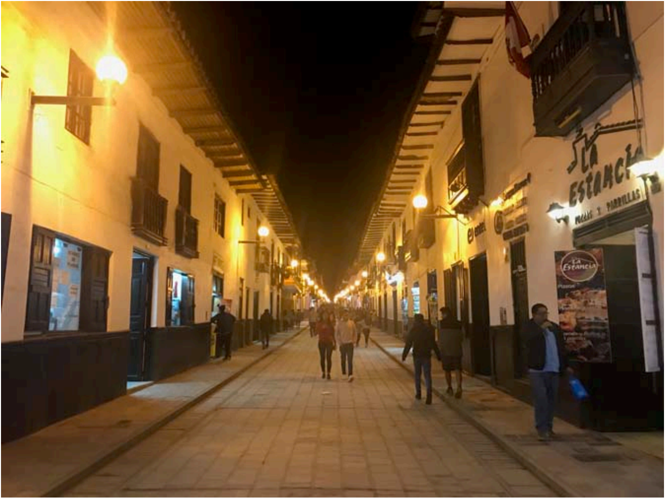
Pedestrian walkway in Chachapoyas, Amazonas, Peru

That means they have to open up additional archaeological sites, which makes sense.