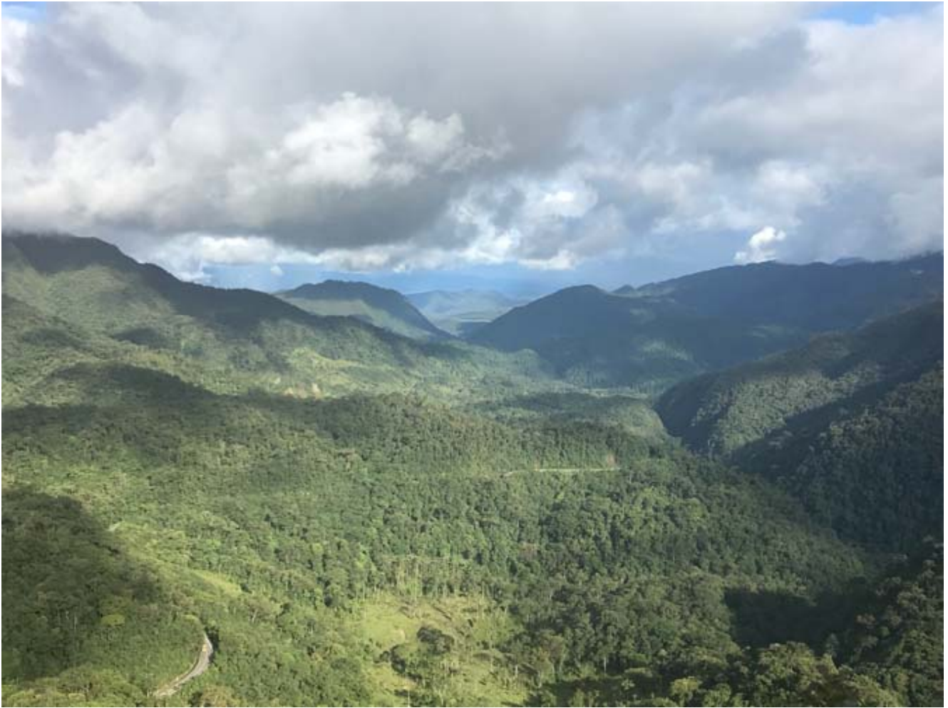
Scenic overlook, Amazonas, Peru

After the scouting expedition this year, when we have better information about places and distances and where to visit, then the idea is in 2020 to have a true expedition where we actually have some media exposure, and we will announce Gene Savoy Xplorations as being active in Peru. We'll have the travel agency set up. And we already have people who have donated space right off the main square for the offices and all of that. So I think this is actually quite exciting. The way that I look at it is, if The Community is going to expand its ministry and at some point and some day have a presence in Peru, which I believe it should, it again has to have some basis for financial survival. So we have to set up some things that are going to bring in revenue. And, obviously, the work that we have done at the ruins can be the revenue stream that initially supports The Community's establishment there. You have to do the one thing before the other. Otherwise, it