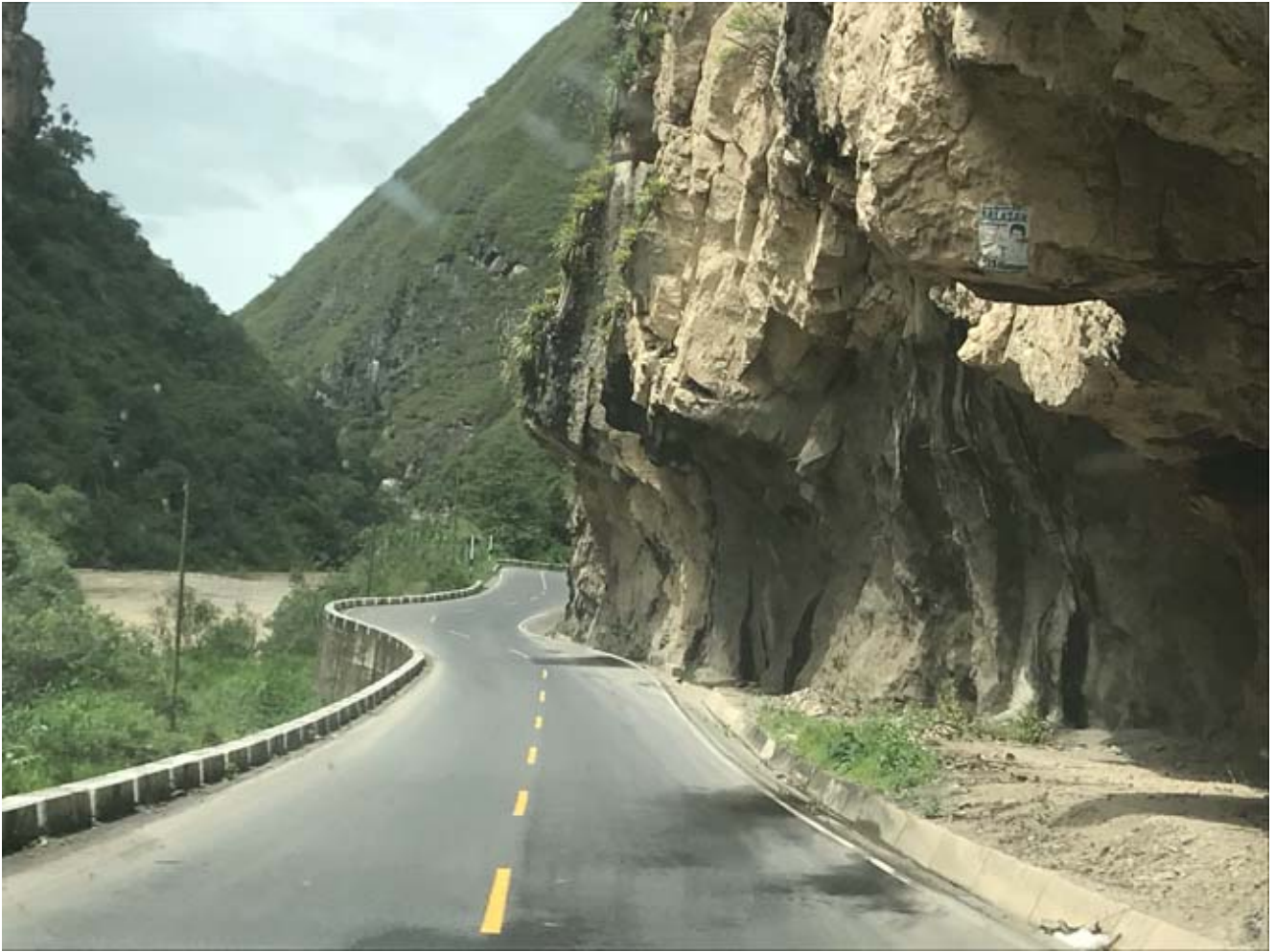
New national road, Amazonas, Peru

Now it's about forty-five minutes to get to Tingo by car. And then, in the old days, you would have to take mules up the mountain, which would take you half a day to get up to the fortress. Now you do the whole trip up the mountain in twenty minutes via the cable cars.