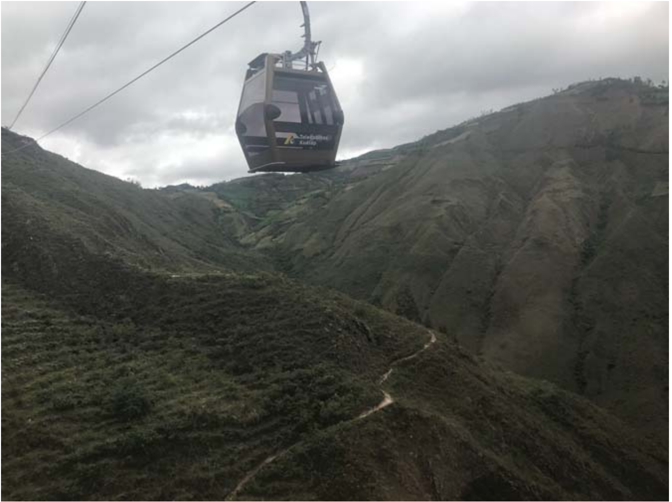
New cable car tramway with old mule trail below

This is the area where we spent many, many decades working. The government is spending a great deal of money there, as I said, which interested me because we had thoughts back in the old days, in the 1990s, of how we could take advantage of the archaeological sites that my father had discovered, and how we could capitalize on that. We were letting the whole world know about these places – these archaeological sites – and where they were, but then other people were coming in and reaping the benefits of what we had discovered. And that's fine, but we should also be a part of that. Maybe thirty years ago wasn't the right time. But now definitely is. In the last twenty years, the Peruvian government has built national road systems that didn't exist before. There are daily flights from Lima to Chachapoyas, which you didn't have before. The townspeople have spent a lot of money in Chachapoyas itself, beautifying their city. It really is quite different from what