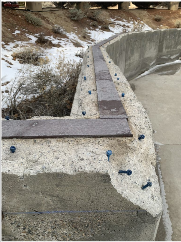
<Cathedral walls in various stages of repair>