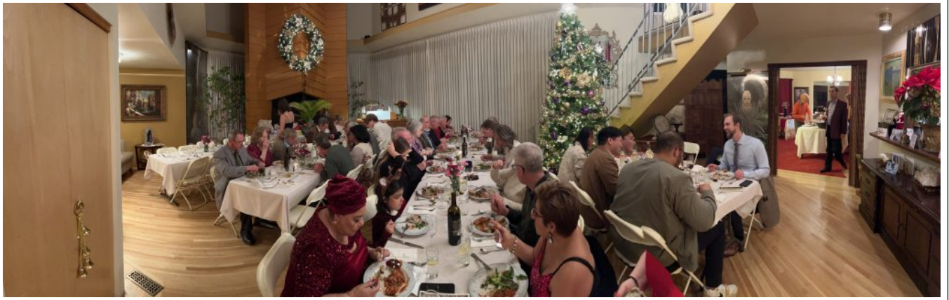
The banquet is underway.