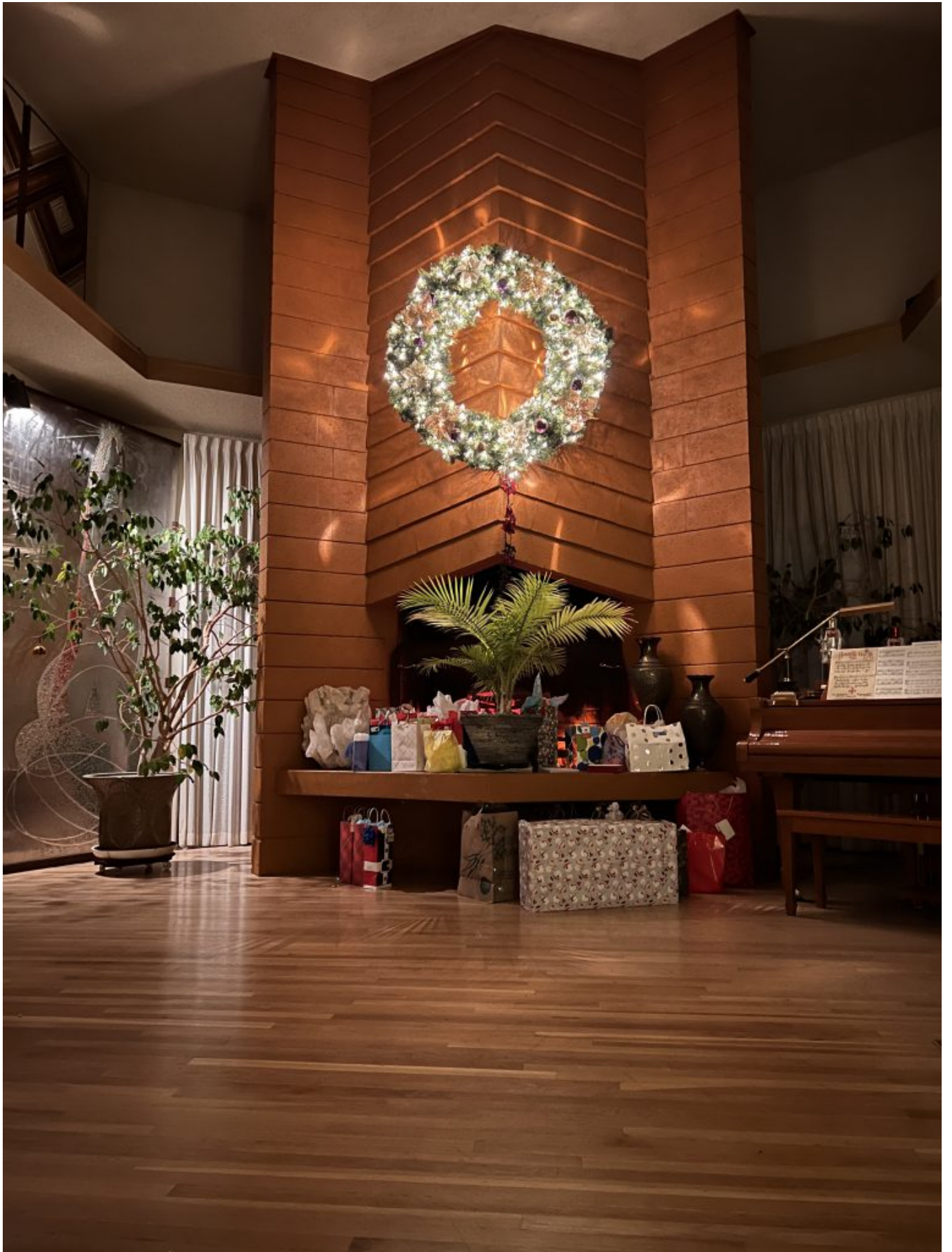
The big wreath over the fireplace with gifts around it.