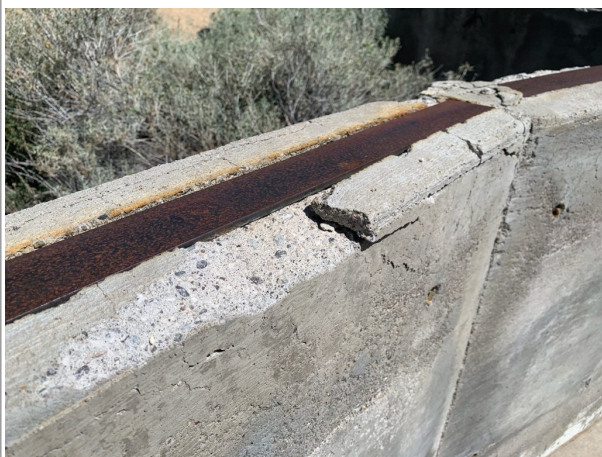
<Another section of Crumbling wall top After repair>