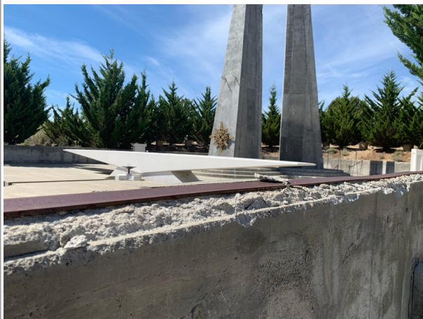
<Crumbling upper wall After repair >