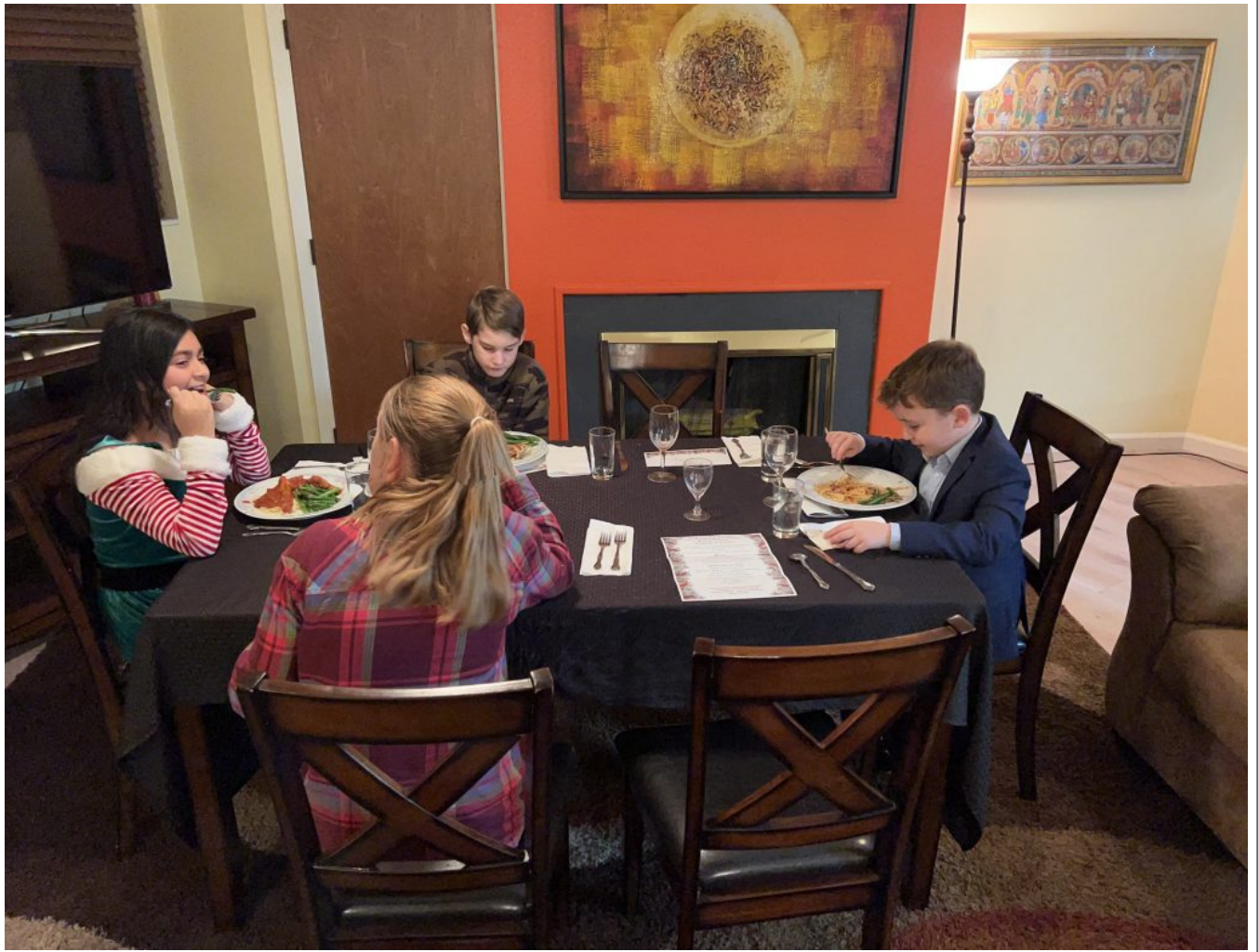
The children's table