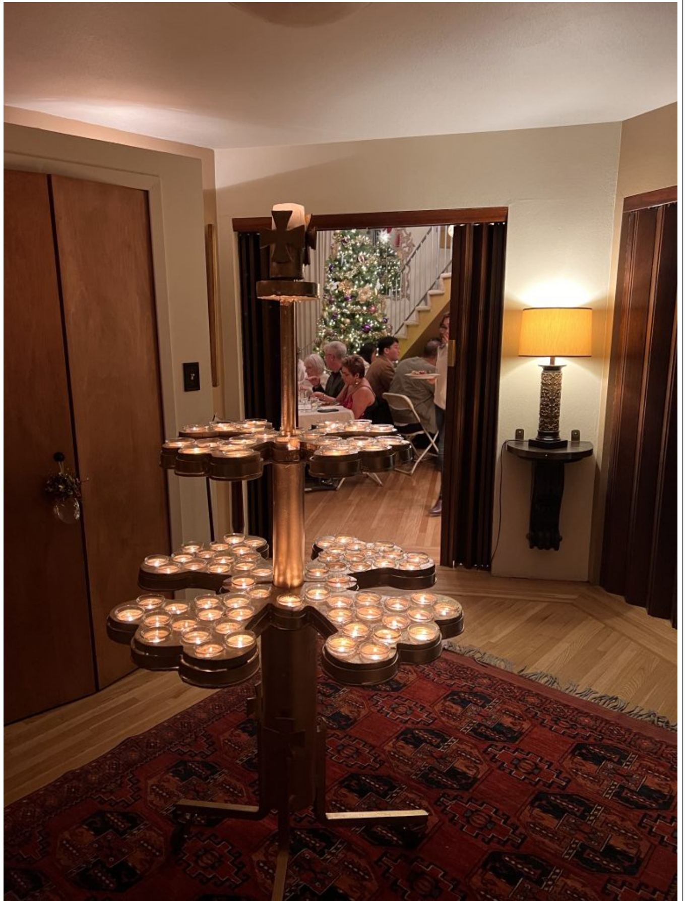
The Candles of Remembrance have been lit.