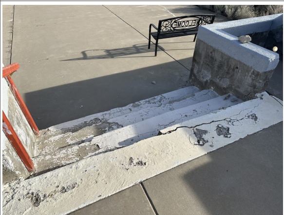
<Crumbling steps at the Bell Choir After complete repair>