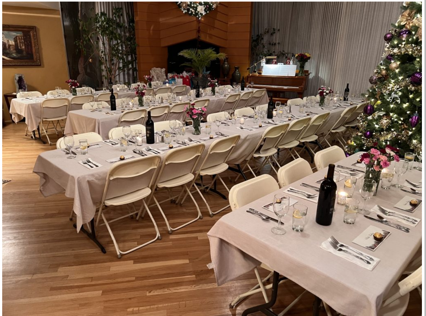
Everything is set for the start of the banquet.