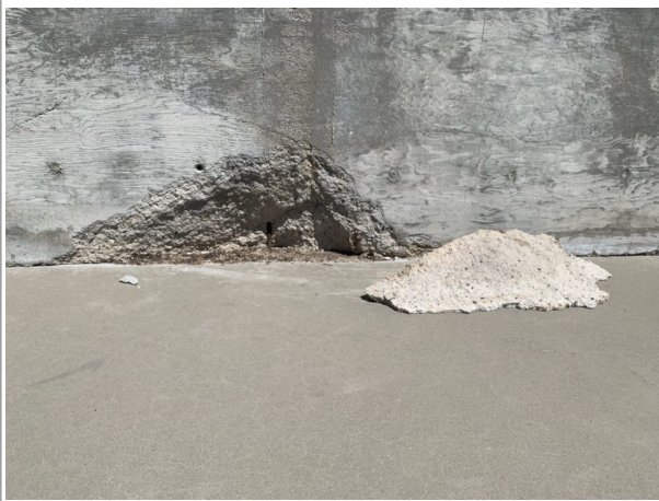
<Crumbling Lower Wall After repair>