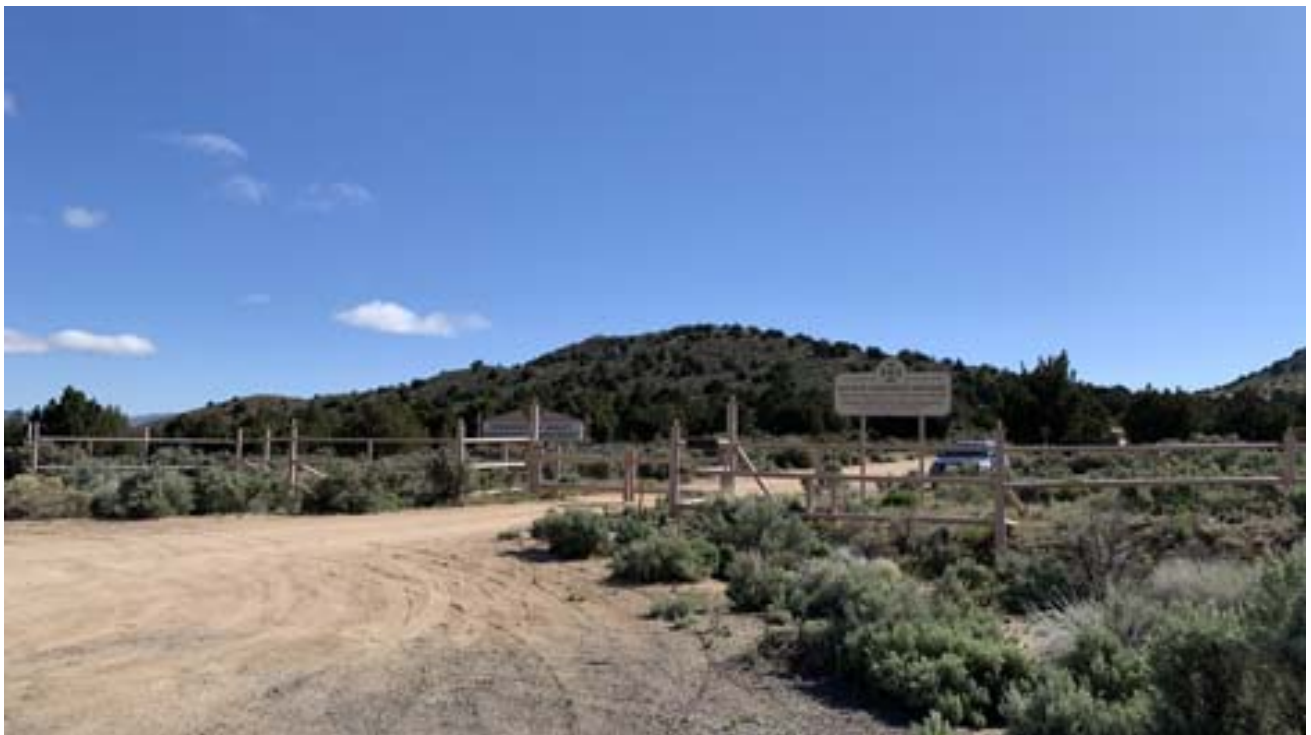
The Sanctuary entrance before construction began