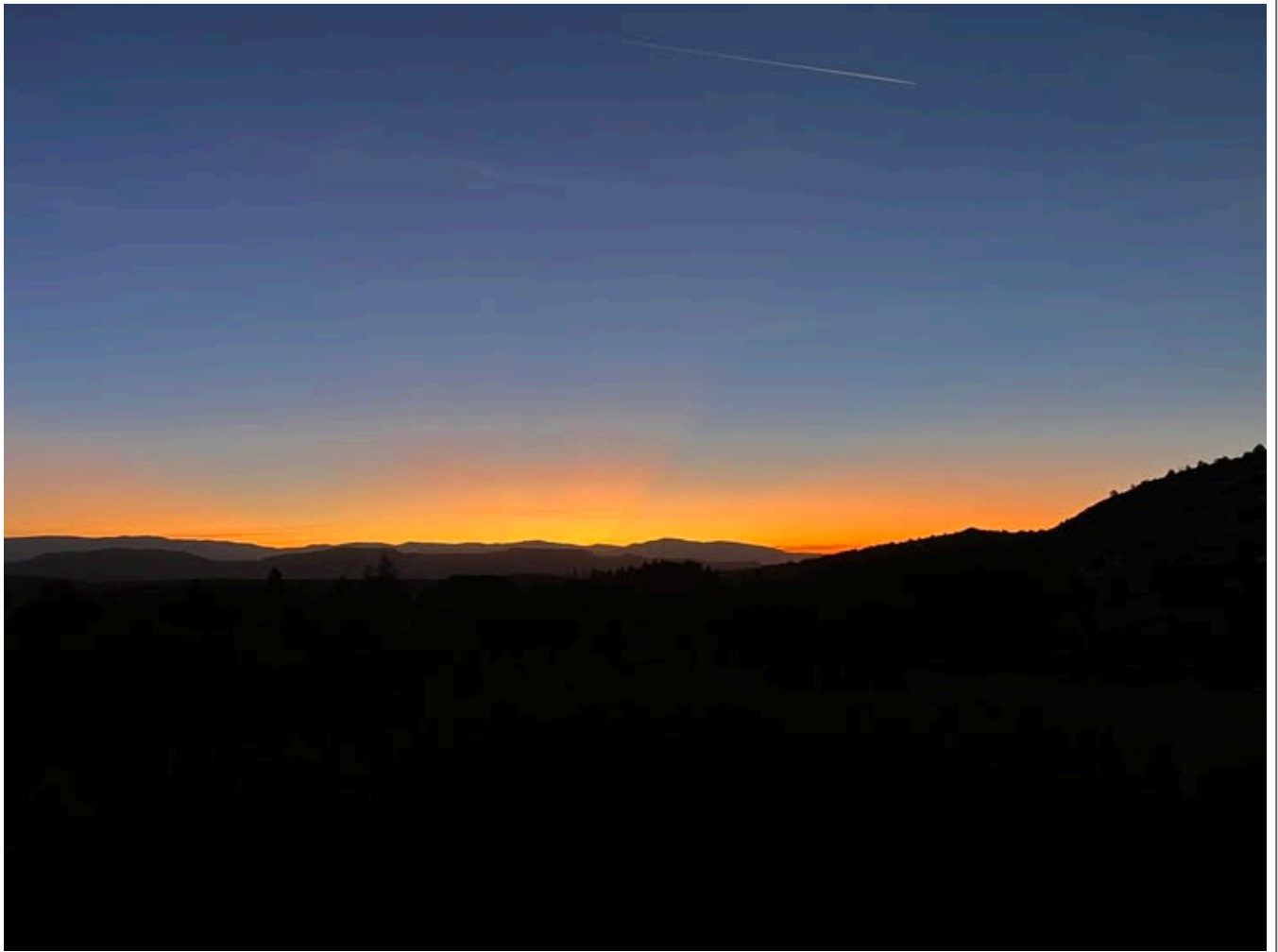
A sunrise during the vigil