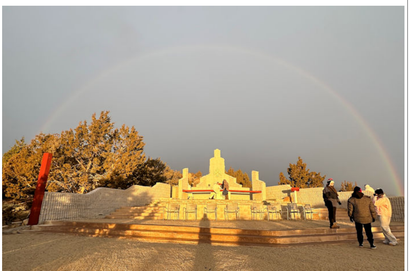
The Church of New Epiphany, where the services were held