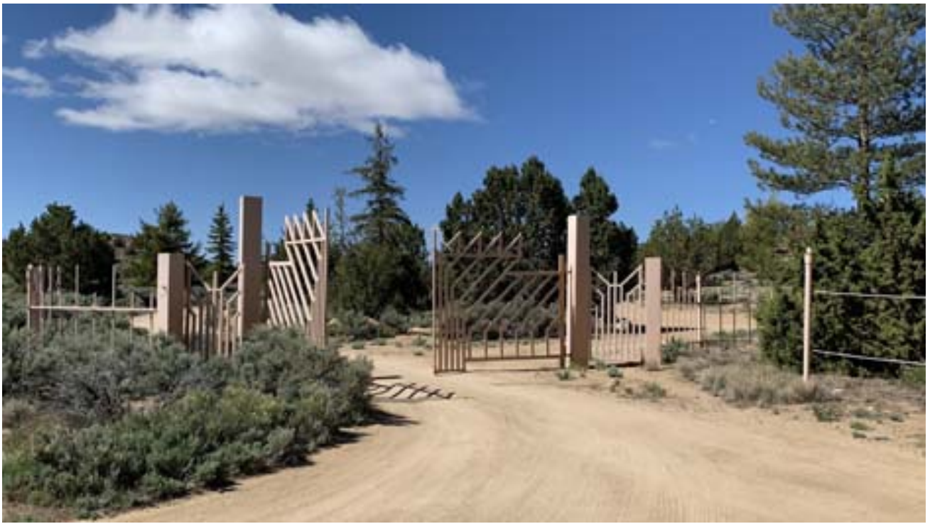
The New Mount Zion gate on the upper level of the sanctuary