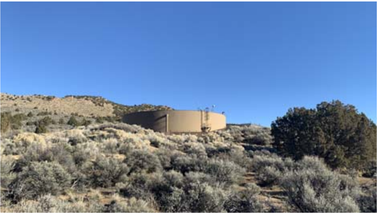
TMWA's 2 million gallon water storage tank

TMWA has had access to their water tank since July 2007 when they entered into an agreement with the Church. As it turns out, the road to access their tank is not big enough to allow their large tanker trucks to get to the tank to perform their water distribution task.