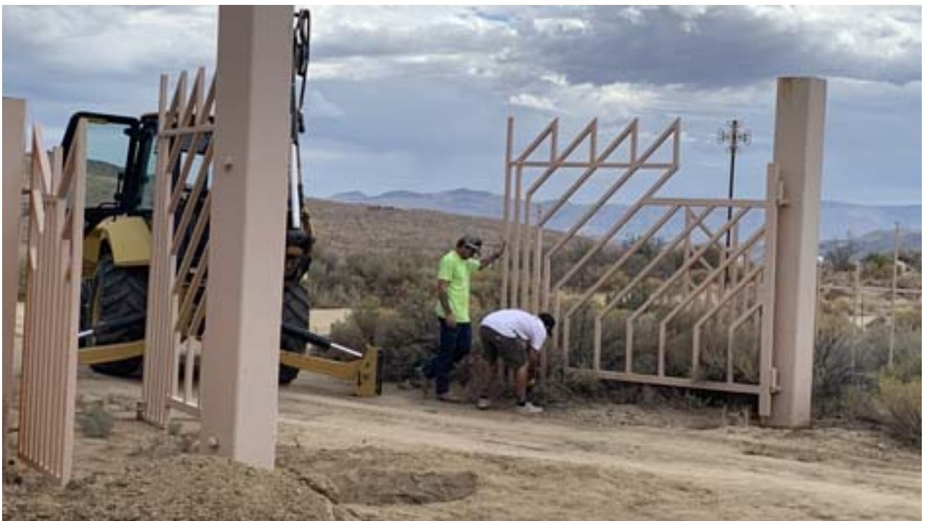
Work begins with the removal of the Zion gate.