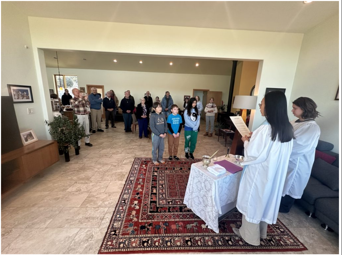
Blessing of the Children