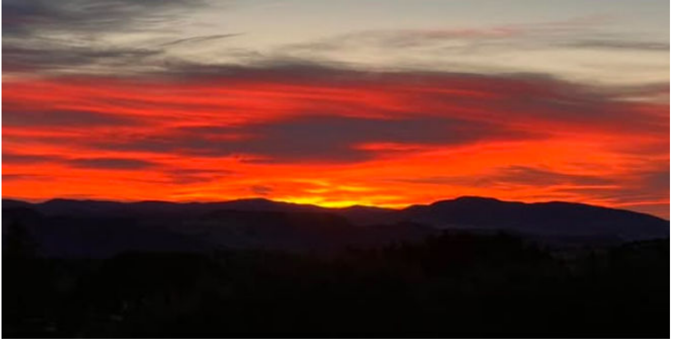
Sunrise on February 3rd, 2025

During this year's sunrise vigil, several spectacular rainbows were observed over the Sanctuary and the entire city of Reno which even caught the attention of local news stations.