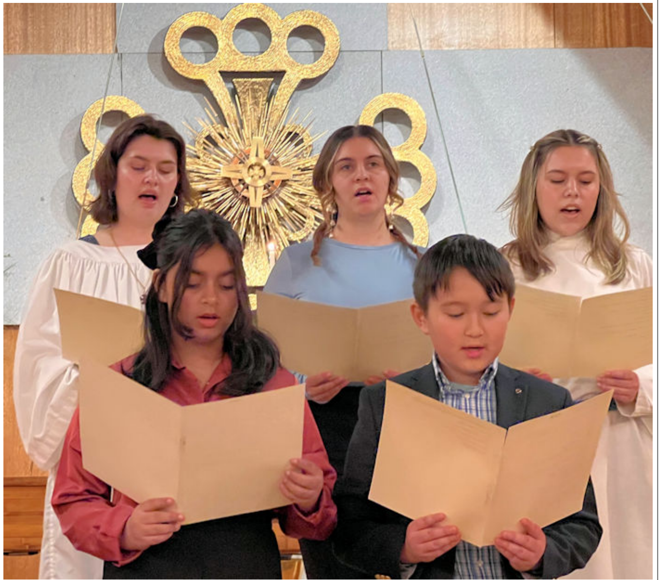
Youths and children of The Community sing "Say Unto Them" at the Remembrance of The Child Service.