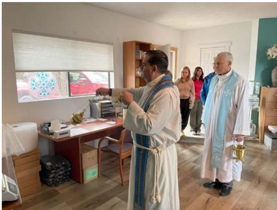
Blessing of an office space.