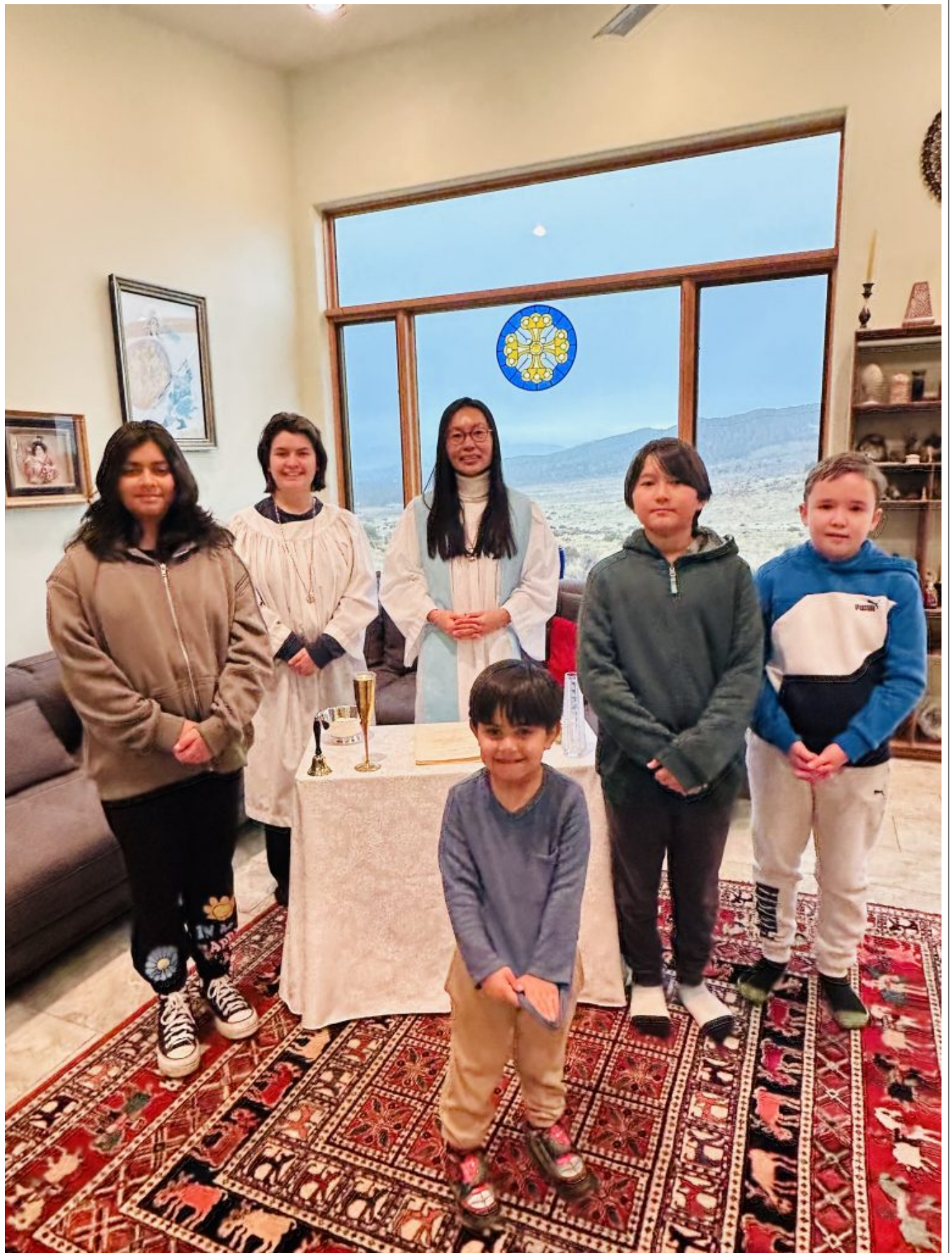
Preparing for the Blessing of the Children