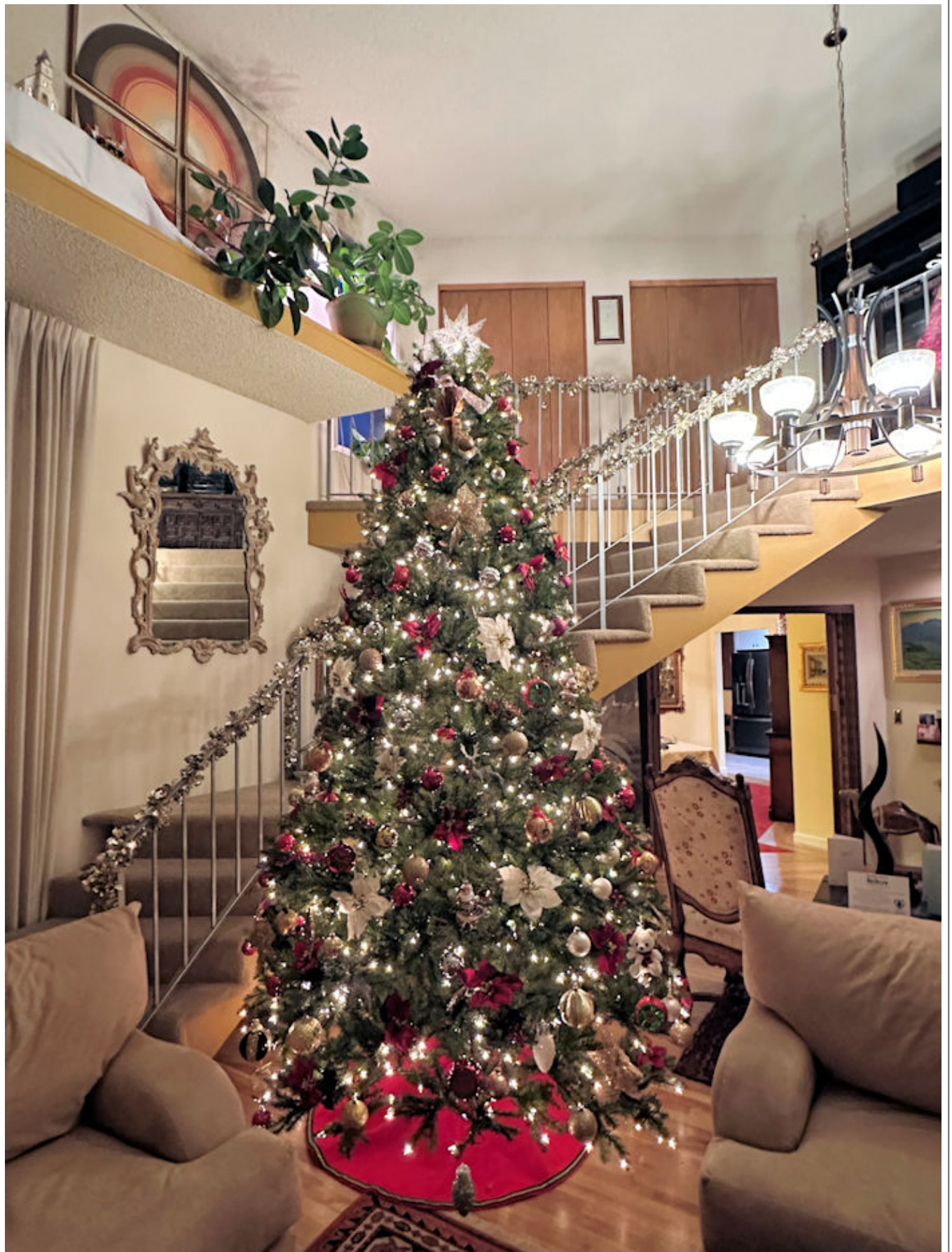
Fully decorated Christmas Tree