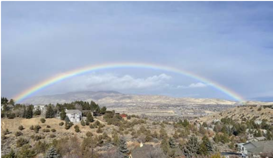
Rainbow over Reno on February 4, 2025