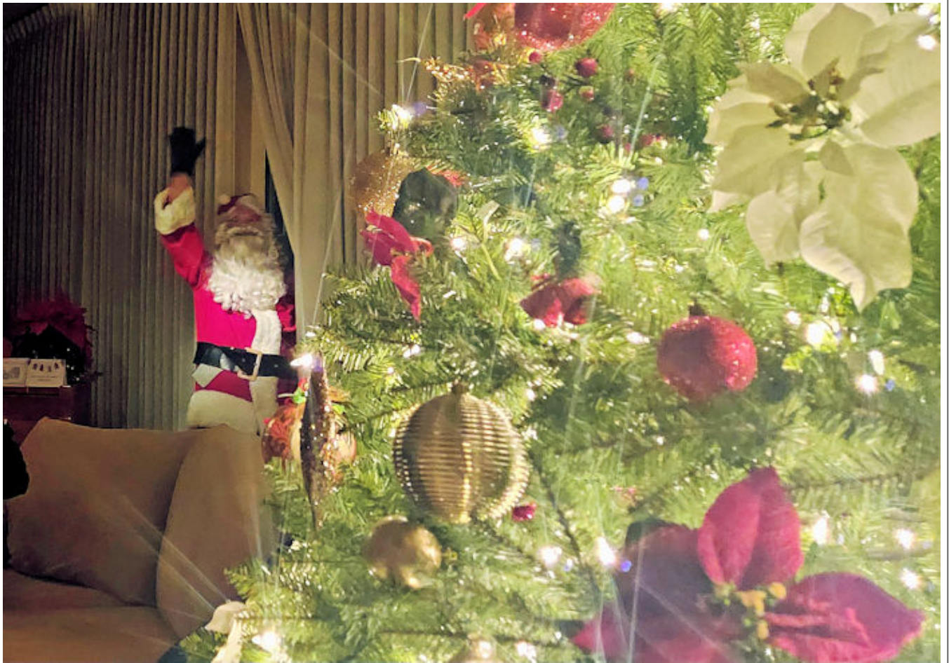
Santa Claus arrives at the end of the festivities with his bags of gifts.