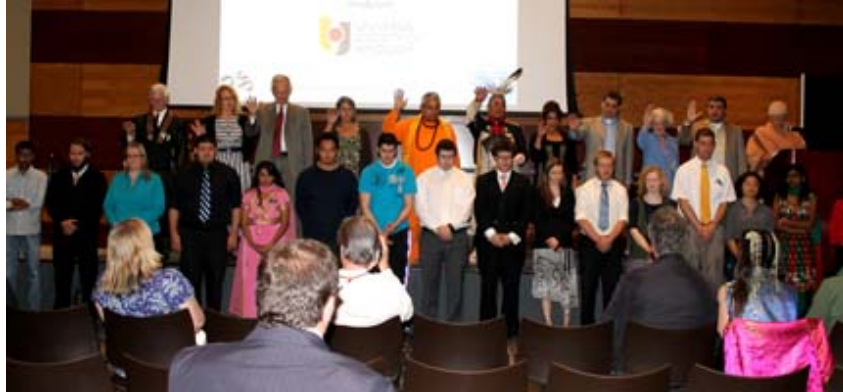
5th Annual Hindu bacculaureate service of the University of Nevada–Reno 2012