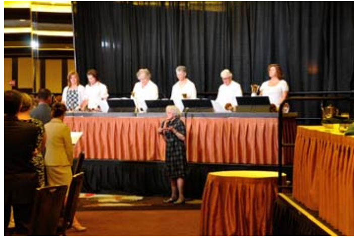
Shepherd's Bells performing at 2012 Nevada Prayer Breakfast

Nevada Prayer Breakfast is a gathering of citizens—as well as civic, business, and community leaders—who wish to pray on behalf of the State and bring the spiritual resources of the community together to bear on issues that face Nevadans.