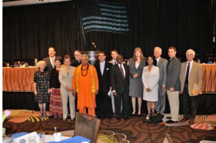
Presenters at the 2012 Nevada Prayer Breakfast.

RENO, Nev., April 24—Leaders of various religions and denominations participated and read prayers for the good of the state at the annual Nevada Prayer Breakfast held in Reno today, where the welcome address was read by Nevada governor Brian Sandoval.