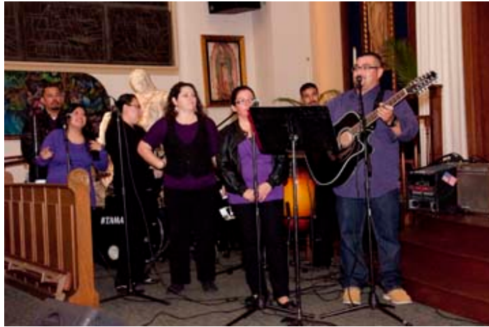
Latino religious songs were performed by the group Sagrada Familia.

The 27th annual Thanksgiving Eve Service, a worship service of prayers, readings, and music from a variety of faith traditions, was held Wednesday November 21, 2012, at St. Thomas Aquinas Roman Catholic Cathedral in downtown Reno with over four hundred persons in attendance.