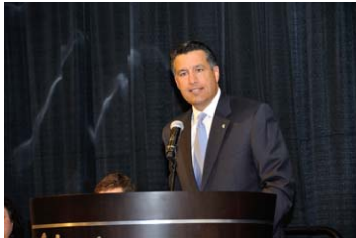
Governor Brian Sandoval speaking at the 2012 Nevada Prayer Breakfast.

Sandoval said that prayer was important and added that Nevada had pulled through various tragedies with the help of faith and prayer.