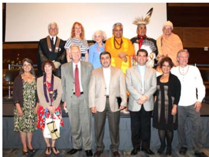
Religious leaders & others who participated in the 5th Annual