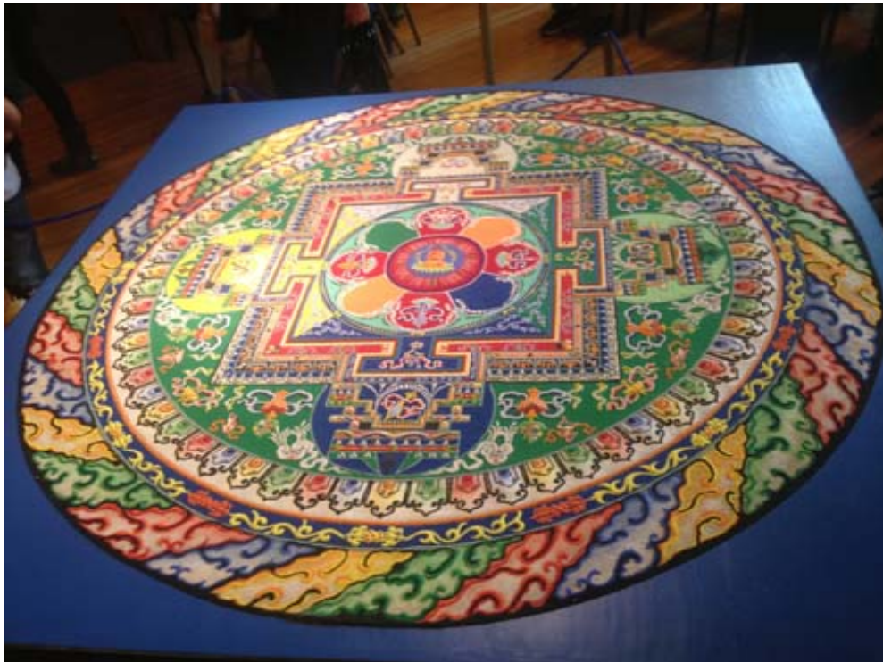
Completed sand painting of Amitabha Buddha mandala

The completion of the sand painting of the Mandala of Buddha Amitabha at the Buddhist Center in Reno was celebrated on October 24, 2014.