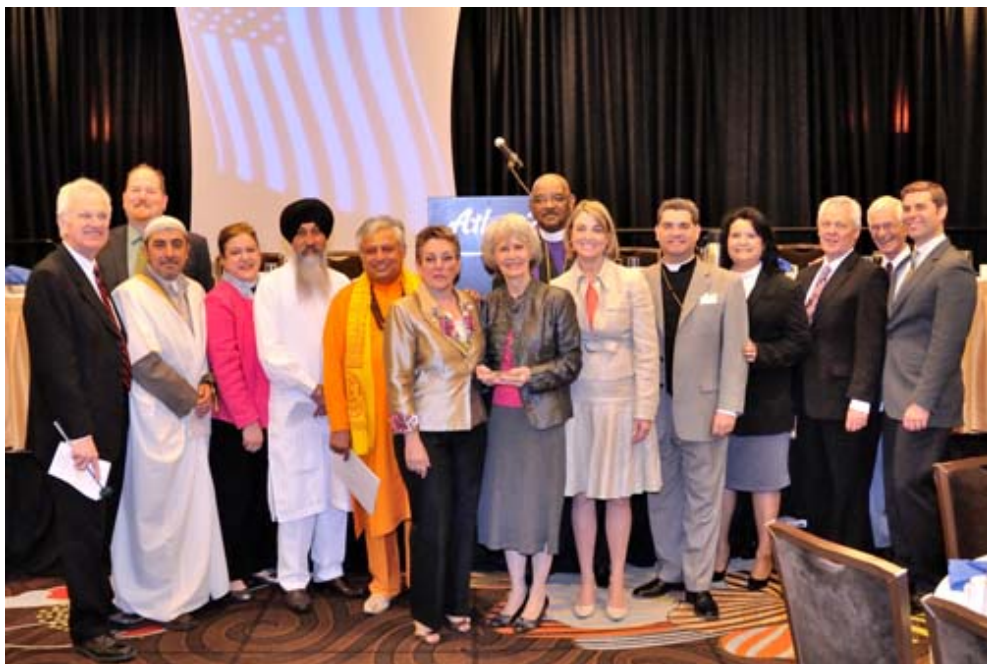
Members of the dais at 2013 Nevada Prayer Breakfast.

Over 300 religious dignitaries and congregation members from Northern Nevada attended the 2013 Nevada Prayer Breakfast on Tuesday April 30, 2013. The one-and-one-half-hour event at the