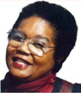
Ms. Melba Beals

Melba Beals, one of the nine students who in 1955 attended Little Rock High School in an effort to end racial segregation and receive equal access to quality education, spoke at AACT High School in Reno, Nevada on Sunday, April 27, 2014.