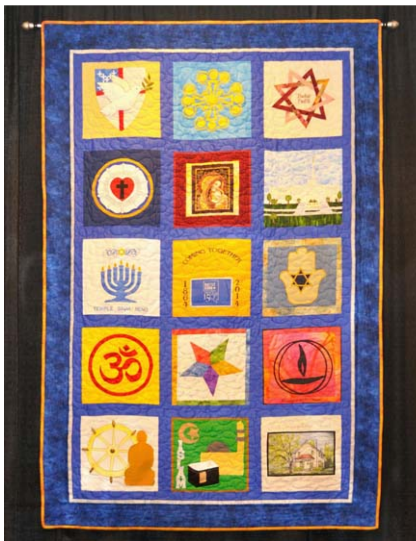
Nevada "Coming Together" Quilt

Members of 14 faith communities pooled their talents to