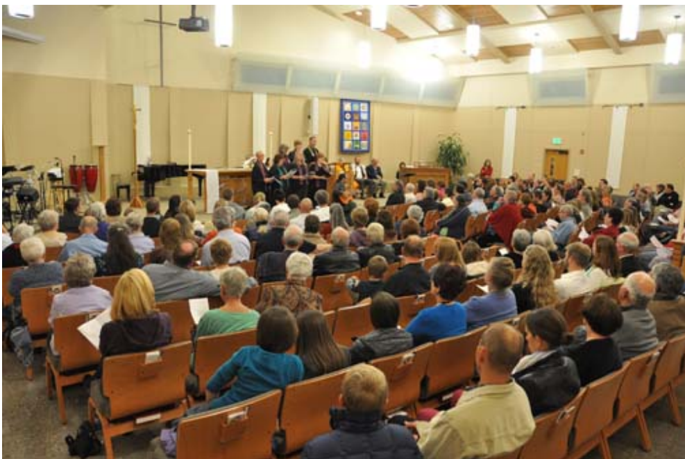
Reno Buddhist Center members perform before a congregation of 300.

Nearly 300 people of various faiths and backgrounds attended the 29th Annual Interfaith Thanksgiving Eve Service held at the Lutheran Church of the Good Shepherd in Reno on Wednesday, November 26, 2014.