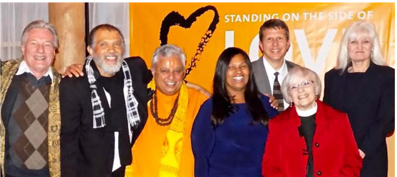
Presenters at 2016 MLK Jr. Community Memorial Service