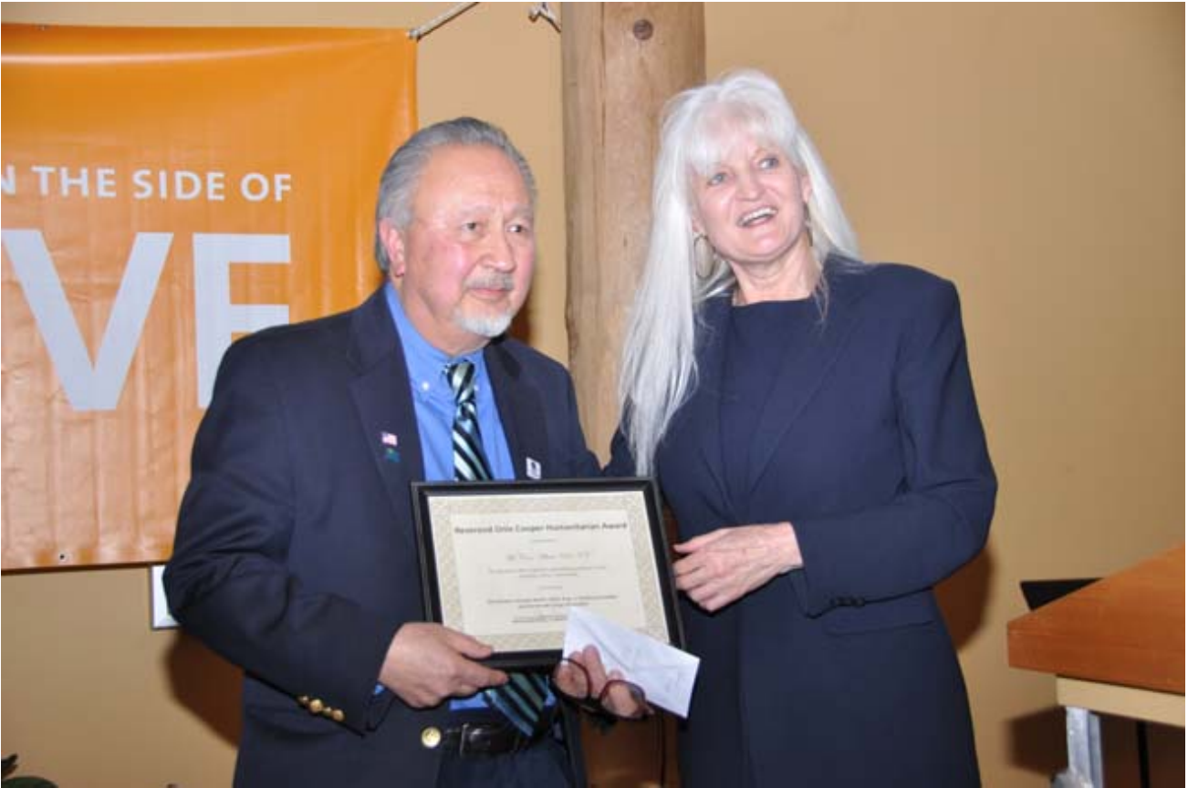
Reverend Onie Cooper Humanitarian Award presented to We Care About Kids NV