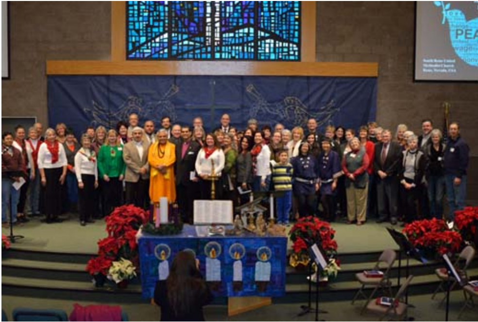
Religious leaders and others after the prayer vigil.

In view of growing violence nationally and globally, diverse northern Nevada faith groups joined hands to pray together on December 20, 2016.