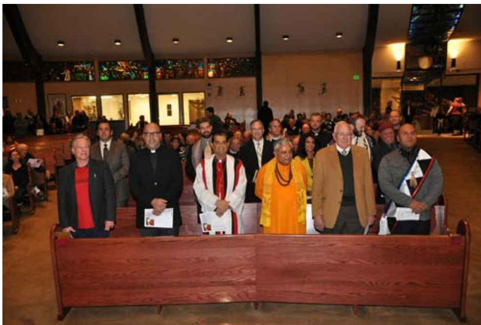
Presenters at 2015 Thanksgiving Eve Service assembled in first pews at Little Flower Church

Open a PDF copy of the 2015 Interfaith Thanksgiving Program.