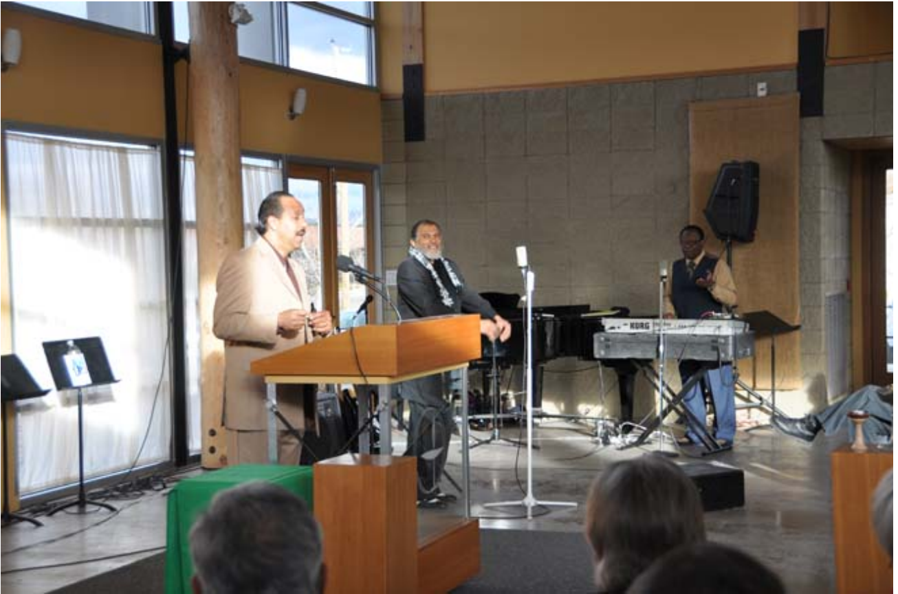
Musical selection performed by The Power of Love