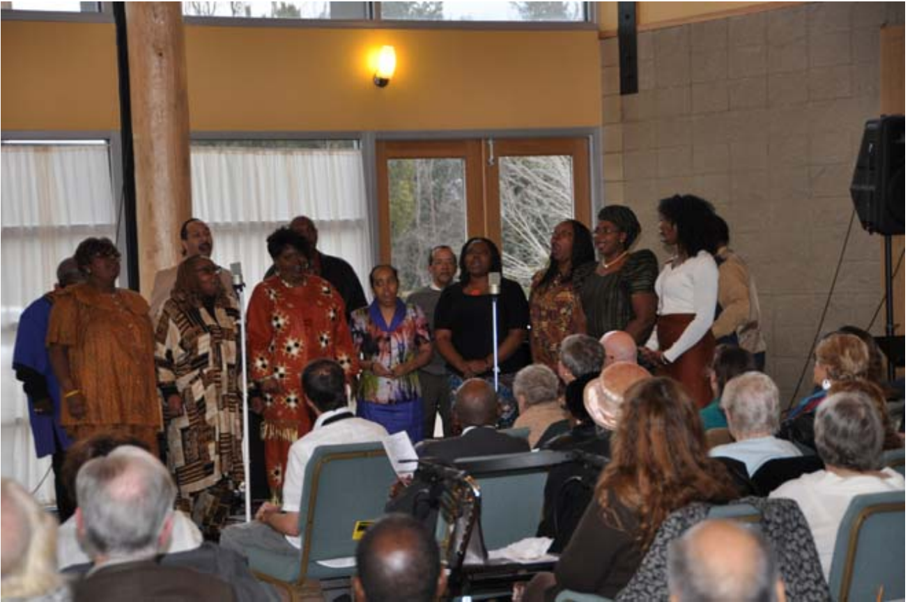
Musical selections performed by Second Baptist Church Choir