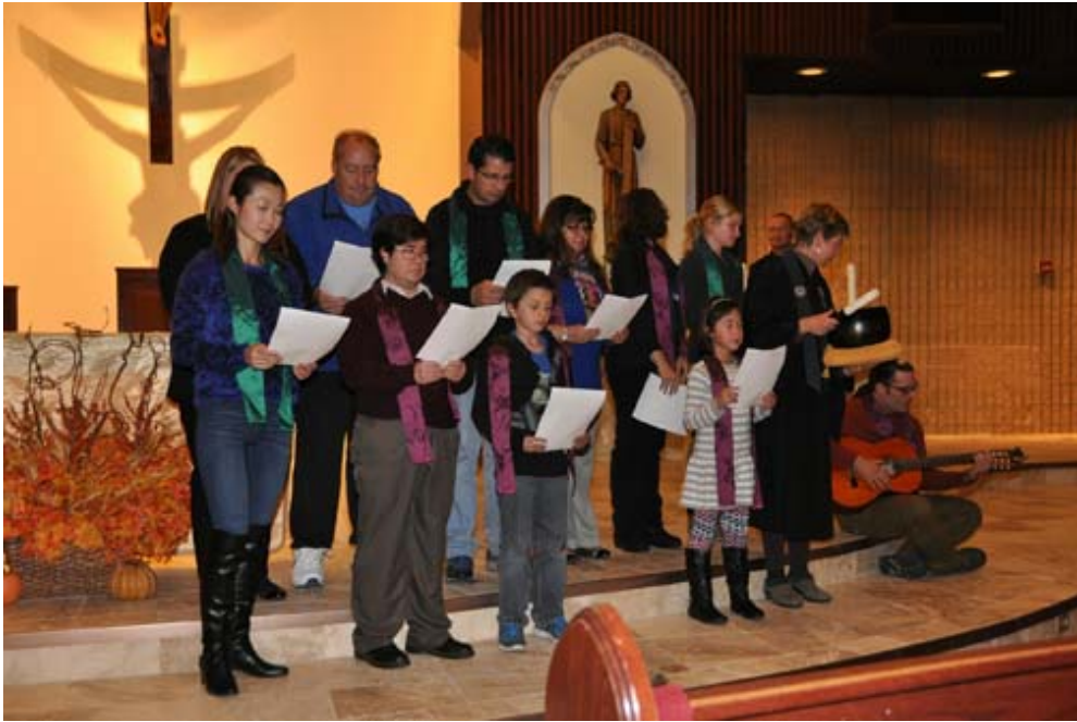
Reno Buddhist Center chanters perform