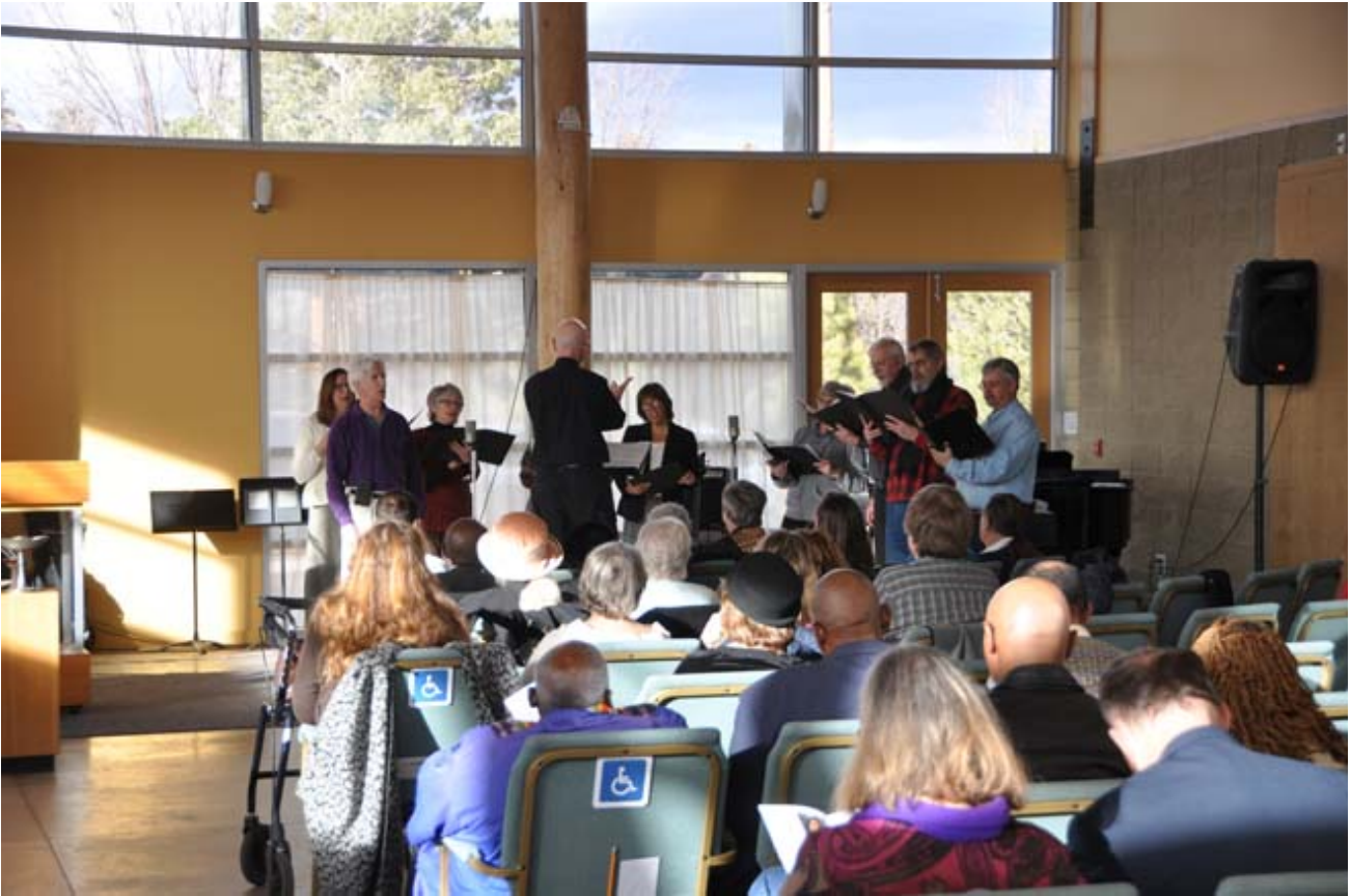
Prelude music: "MLK" performed by the UUFNN Choir