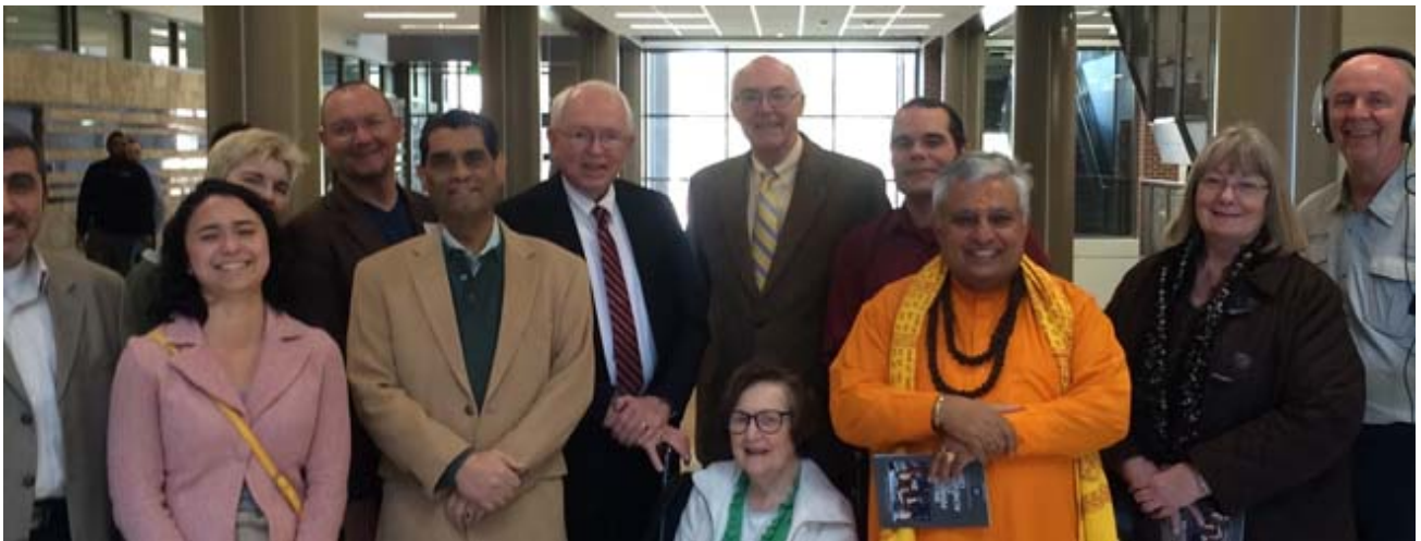
Interfaith committee members meet May 31, 2016 to discuss logistics of University of Nevada-Reno Meditation and prayer Room.