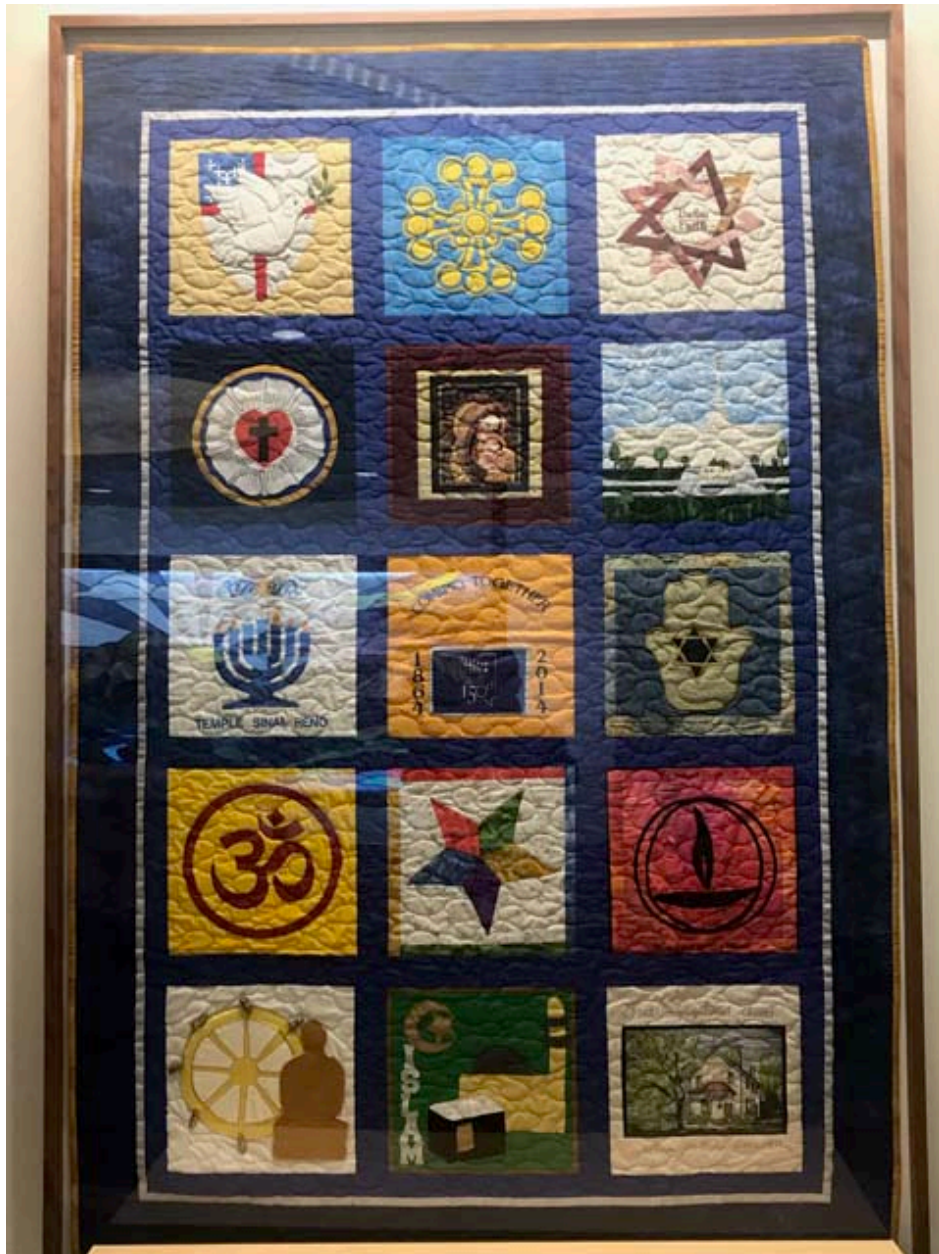
Nevada Interfaith quilt mounted on display in the Interfaith Chapel