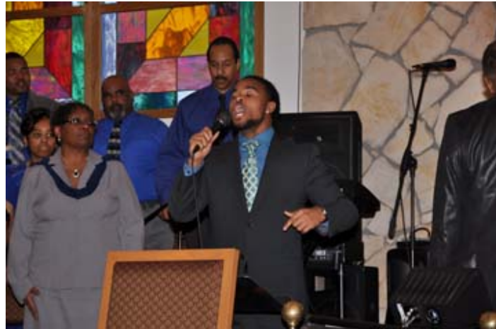
Members of the Second Baptist Church Choir perform at the 2012 MLK Jr. celebration.