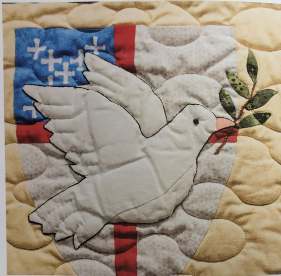
ABOVE: A dove with an olive branch on the Trinity Episcopal Church block. OPPOSITE: Blue sashing unites the participants' message while giving each block space to be counted.