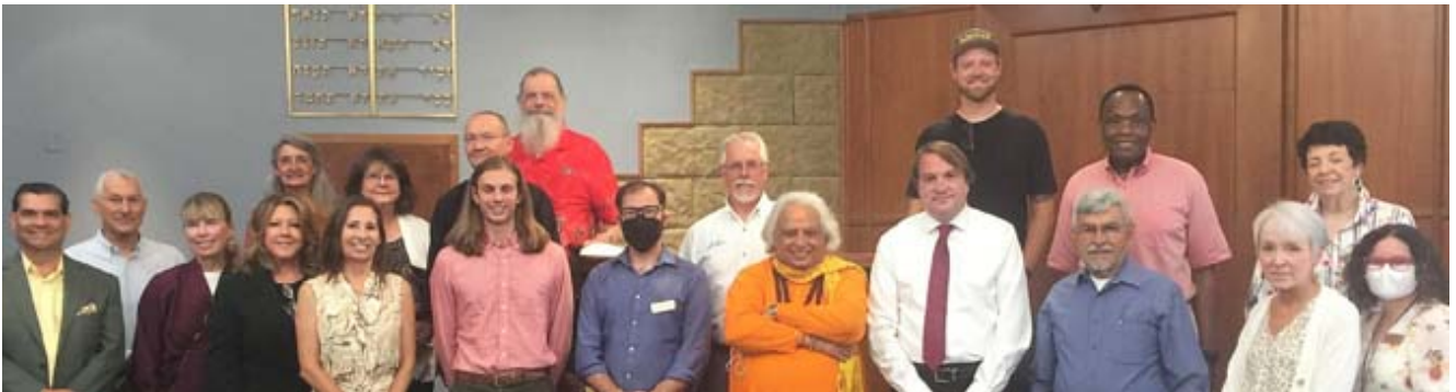
Attendees at the multi-faith clergy luncheon dialogue July 6, 2022

✘ The Nevada Interfaith Association held its second bi-annual luncheon for 2022 on Wednesday, July 6, 2022 at Temple Sinai, 3405 Gulling Road, Reno, NV 89503.