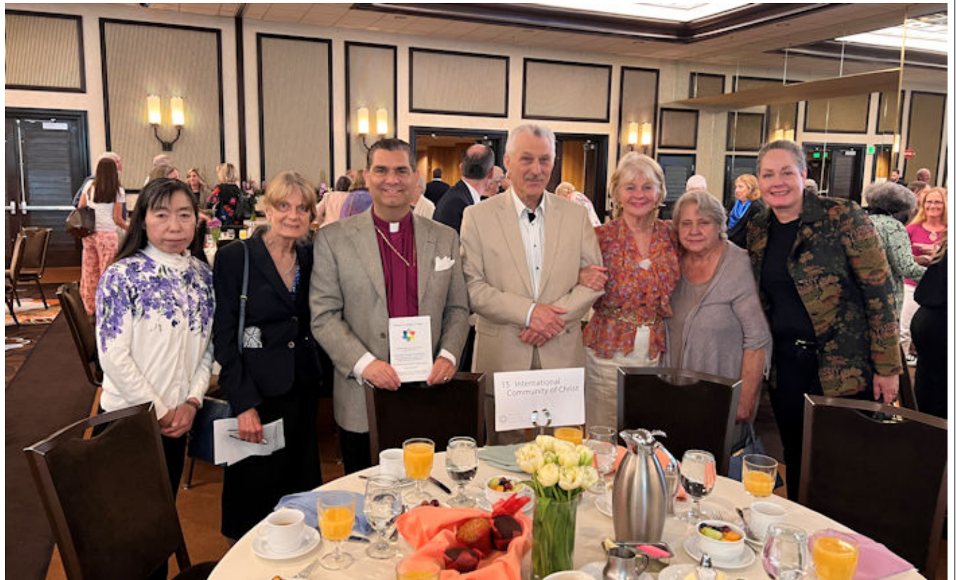
The ICC group at our table.

The Nevada Prayer Breakfast, organized by the Nevada Interfaith Association (NIA), was held Wednesday, May 17, 2023, 7-9 a.m. at the Paradise Ballroom of the Atlantis Casino Resort and Spa. The theme of this year's Nevada Prayer Breakfast was "Living Art – Pathway to Peace"