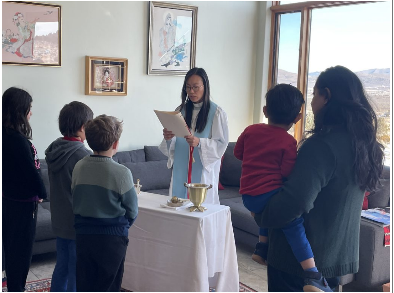
Blessing of the Children