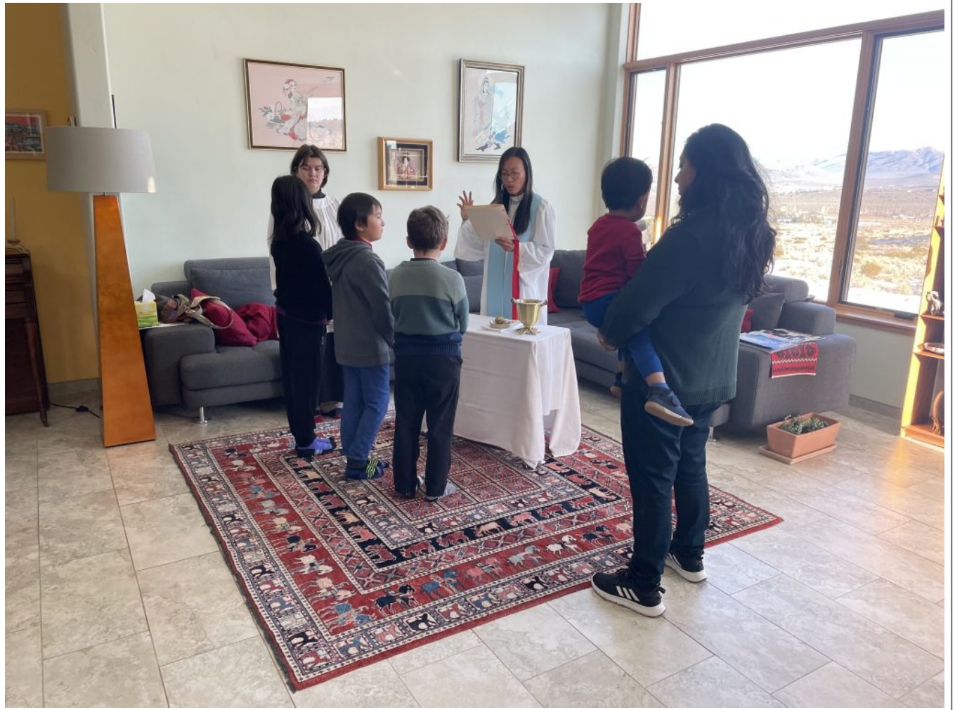
Blessing of the children