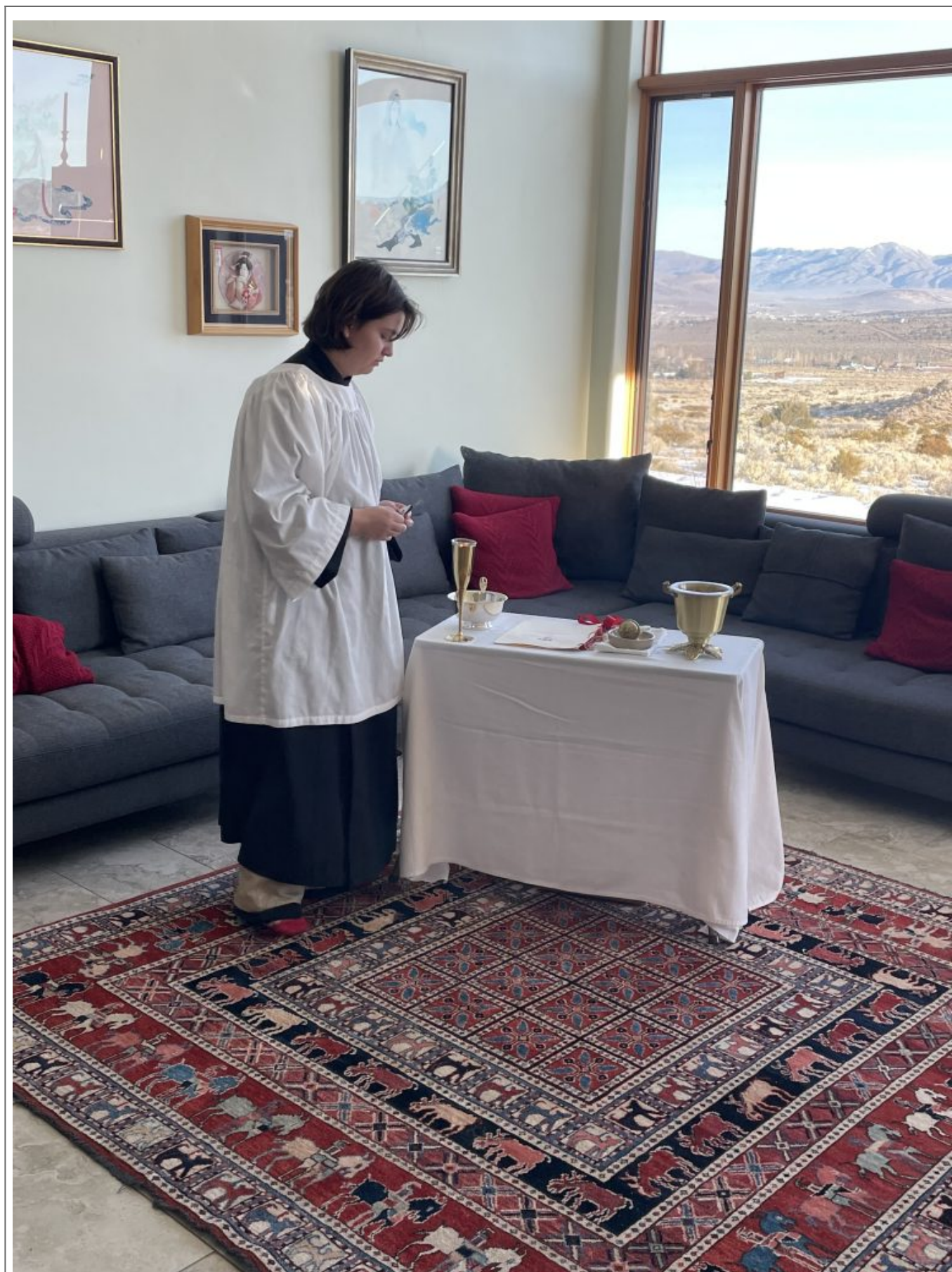
Preparing for the Blessing of the Children 1