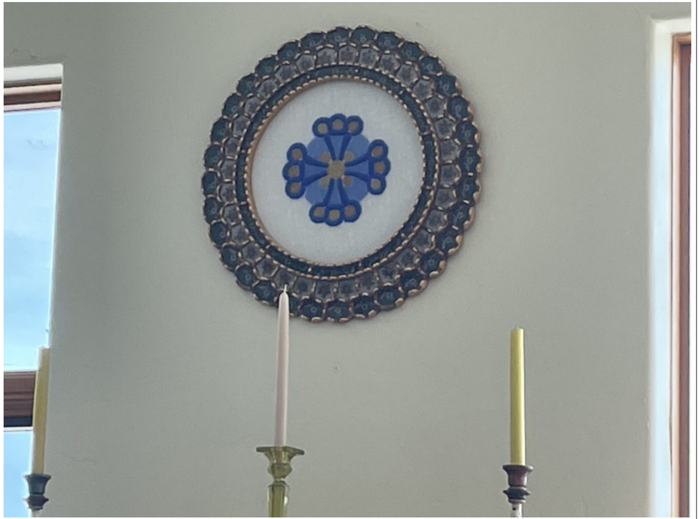
Stained glass cross