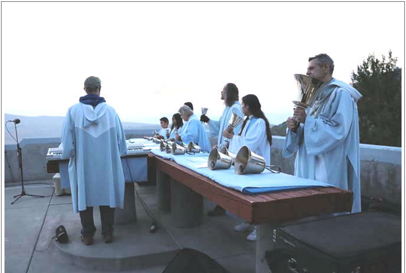
The Jamilian Bell Choir during Divine Sunrise Service.

Following the tour of the museum, a buffet style Banquet was held at Bishopstead.