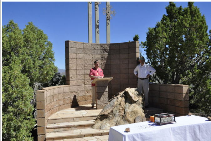
Bishop Savoy lectures at the Monastery Gardens