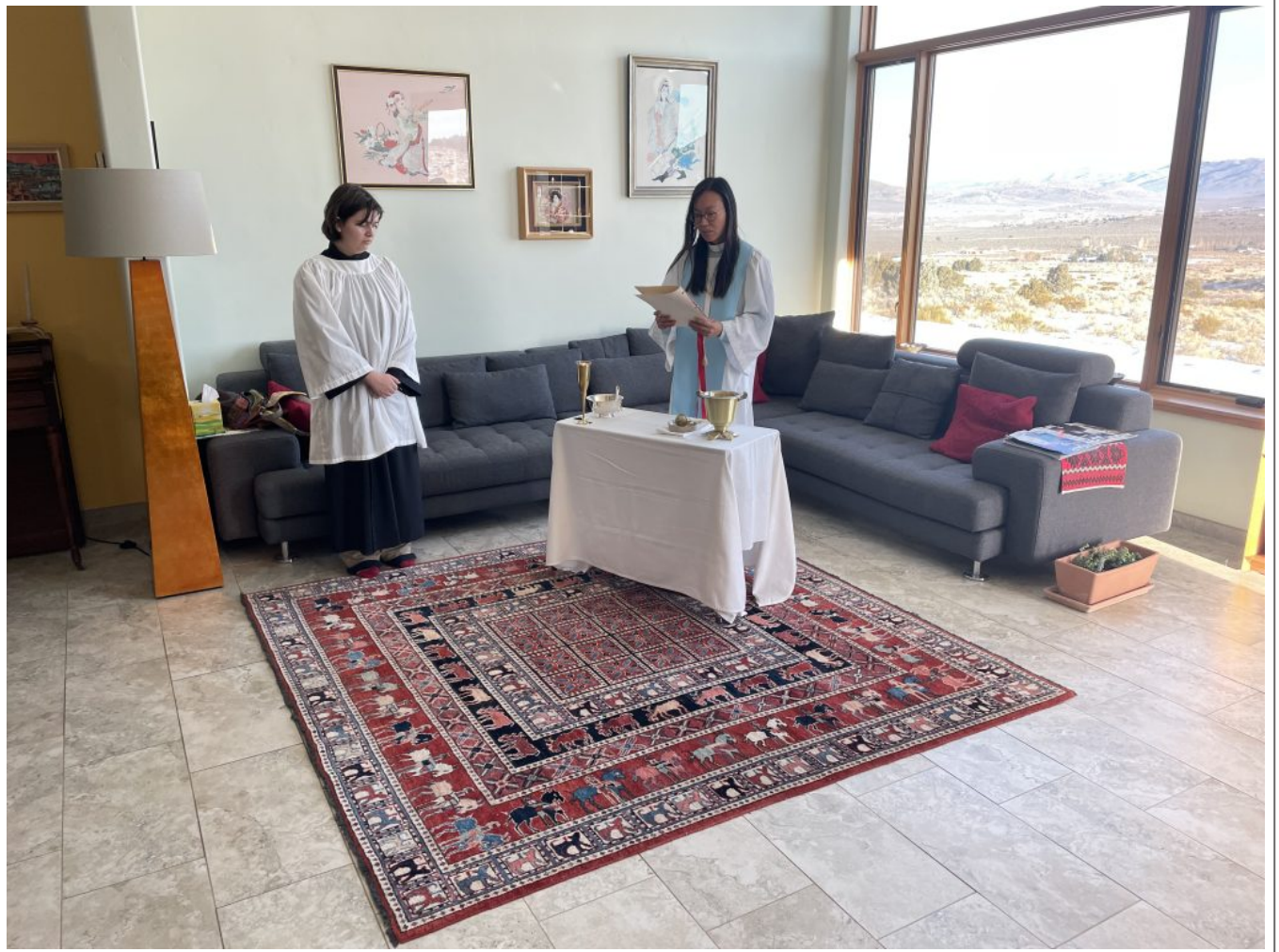
Preparing for the Blessing of the Children 2