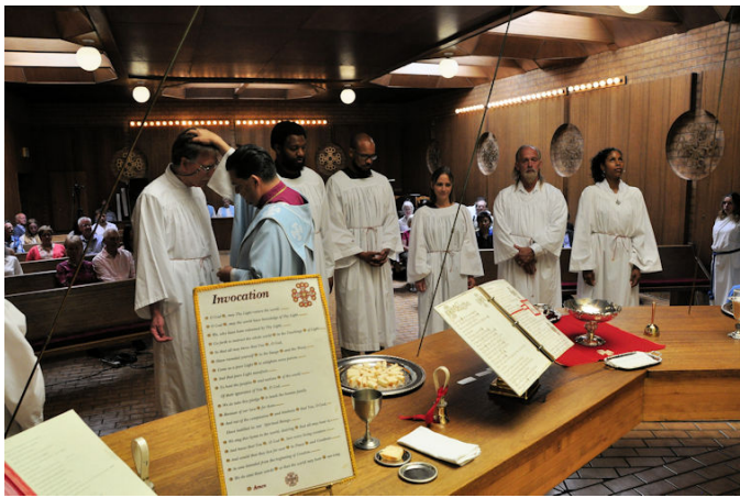
Bishop Savoy performing First Level Ordinations