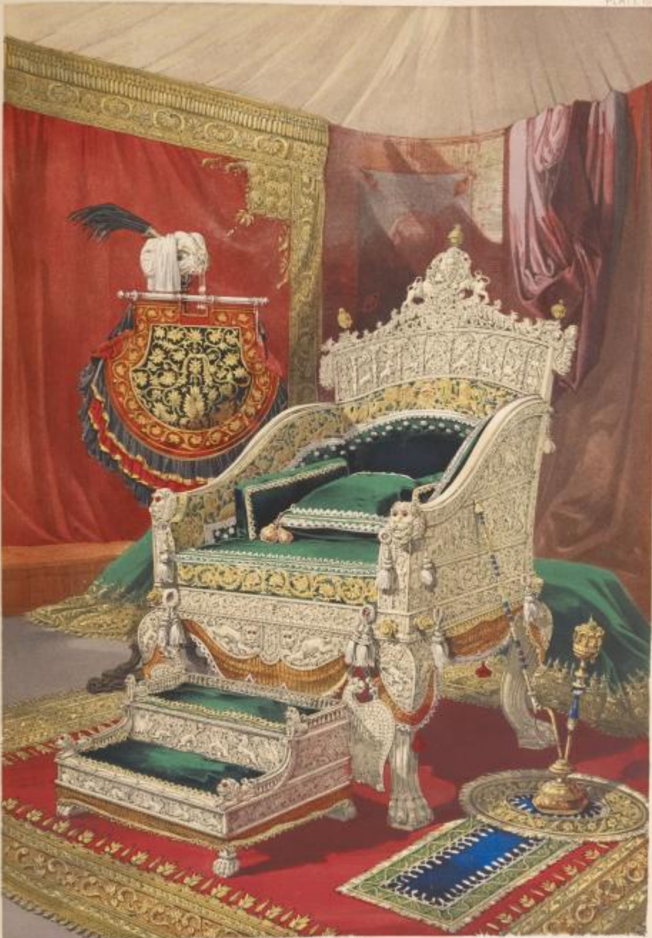
IVORY THRONE AND FOOTSTOOL, PRESENTED TO HER MAJESTY THE QUEEN, BY HIS HIGHNESS THE RAJAH OF TRAVENCORE.

W. & A. GILBERT, 11, PATERNOSTER ROW, LONDON. PRINTED AND PUBLISHED BY W. & A. GILBERT, 11, PATERNOSTER ROW, LONDON.