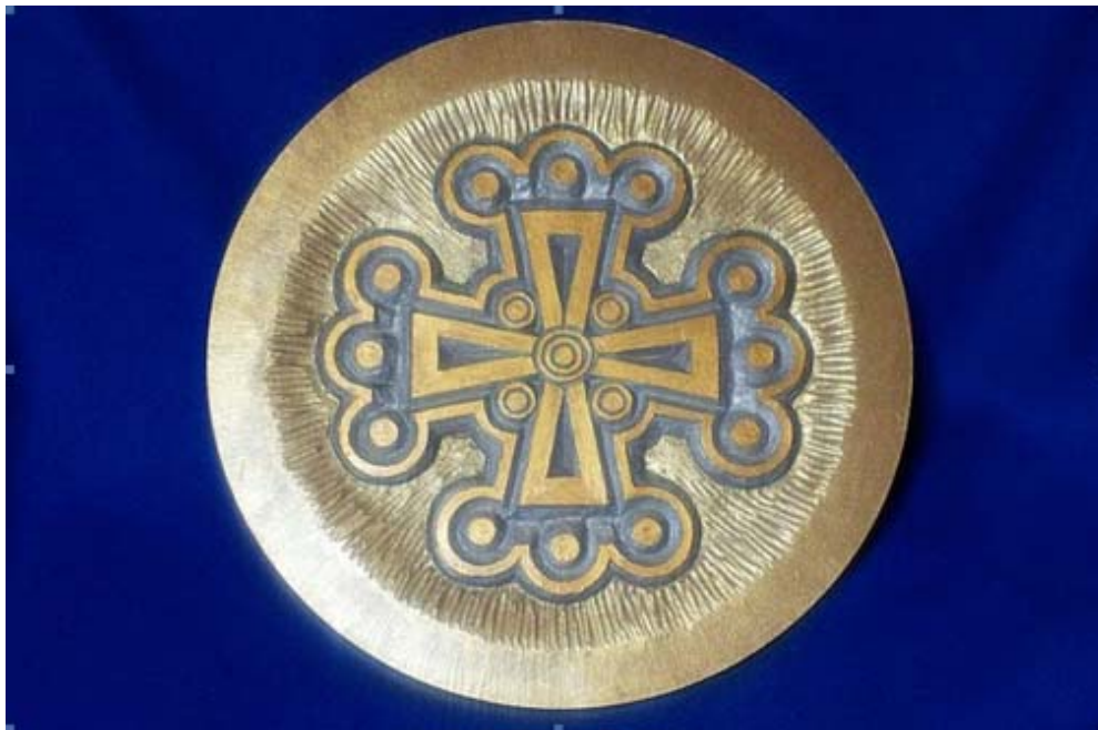
Japanese-style Second Advent Cross

“As the portrait painter keeps an eye upon the king’s face as he draws, and when the king’s face is toward him, he draws the portrait easily, but when the king turns his face away, he cannot draw. In like manner, Christ, the good artist to those who believe in him and gaze continually at him, straightaway portrays after his own image a heavenly person. Out of his own spirit, out of the substance of Light itself, the ineffable Light, he paints a heavenly image. If a person