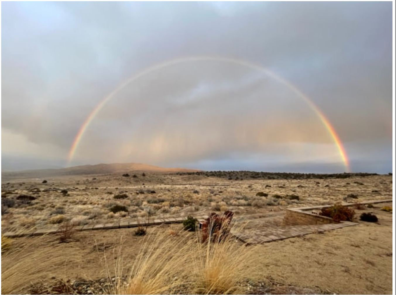
Double rainbow during Epiphany Eve Sunrise Service.

Friday and Wednesday Chapel Services were suspended during the Vigil.