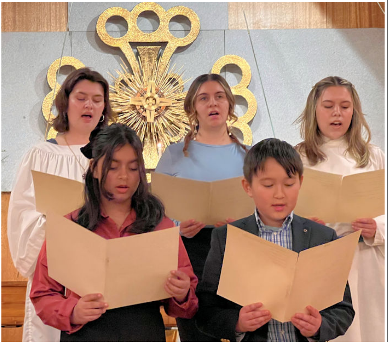
Youths and children of The Community sing "Say Unto Them" at the Remembrance of The Child Service.