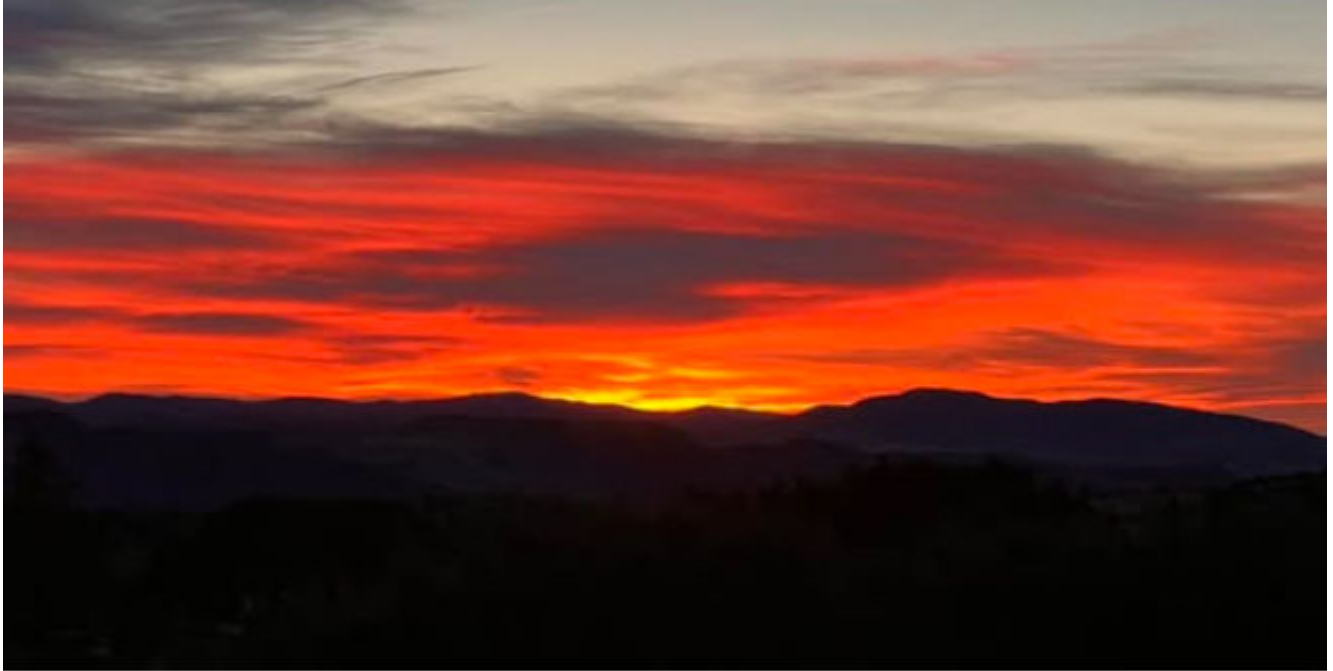
Sunrise on February 3rd, 2025

During this year's sunrise vigil, several spectacular rainbows were observed over the Sanctuary and the entire city of Reno which even caught the attention of local news stations.