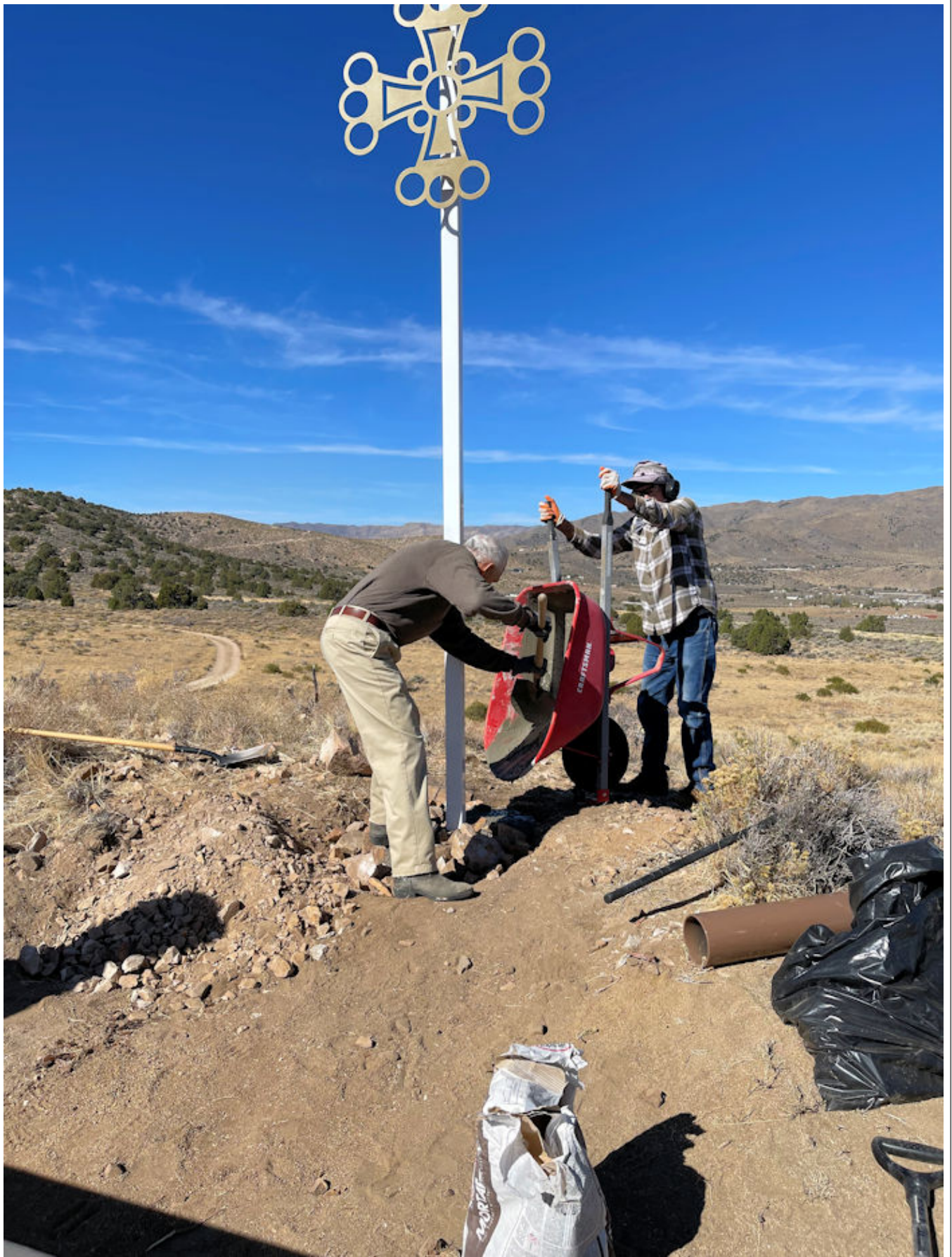
Setting the new cross that has a steel pole instead of wood