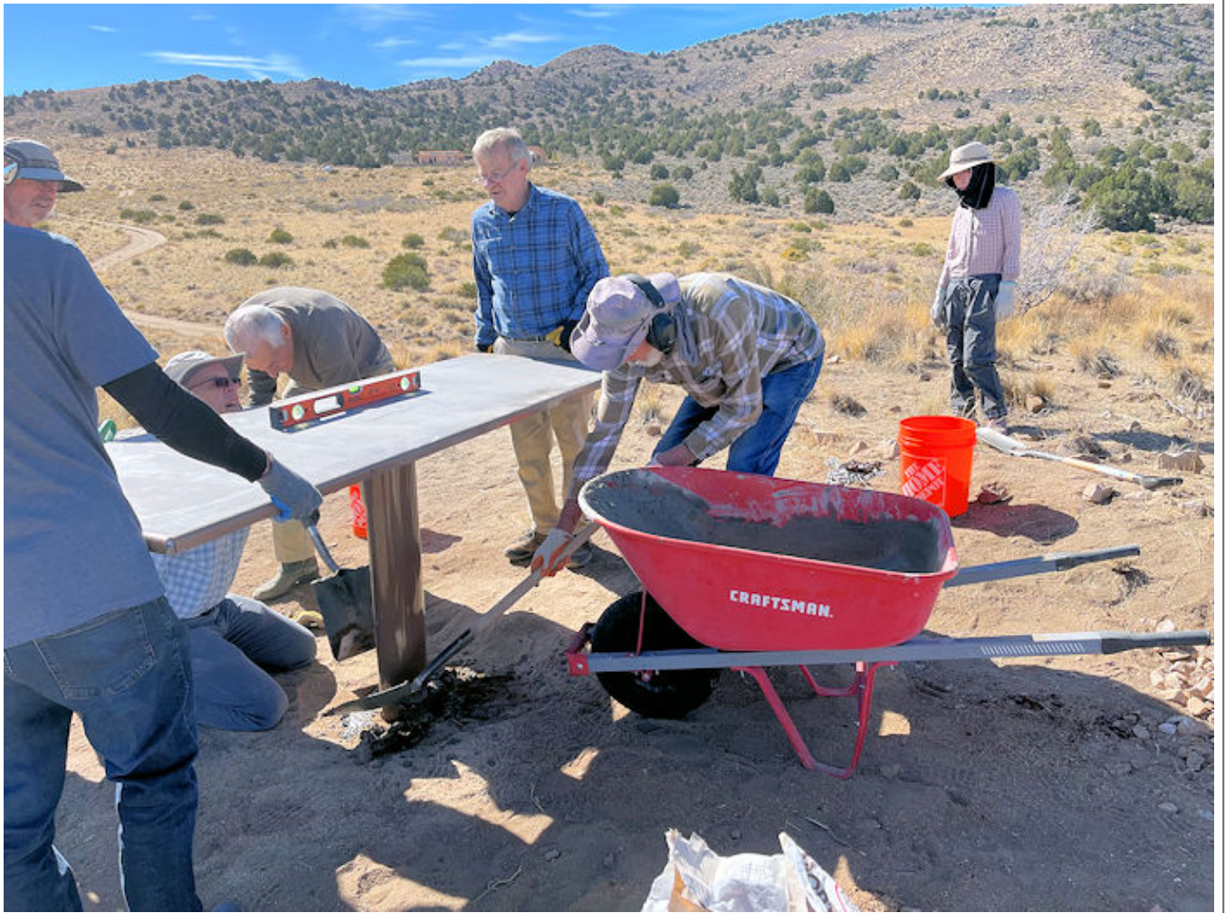
Putting the steel top on the posts to form the new communion table