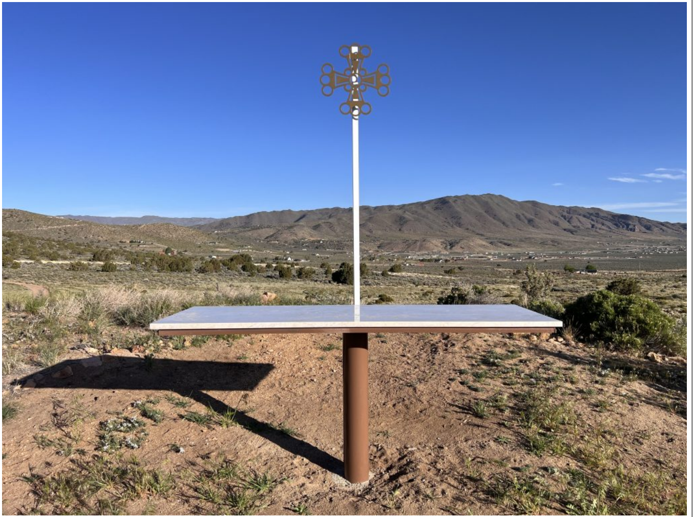
The finished table with the new granite top

When the Balance Between Material and Spiritual tilts