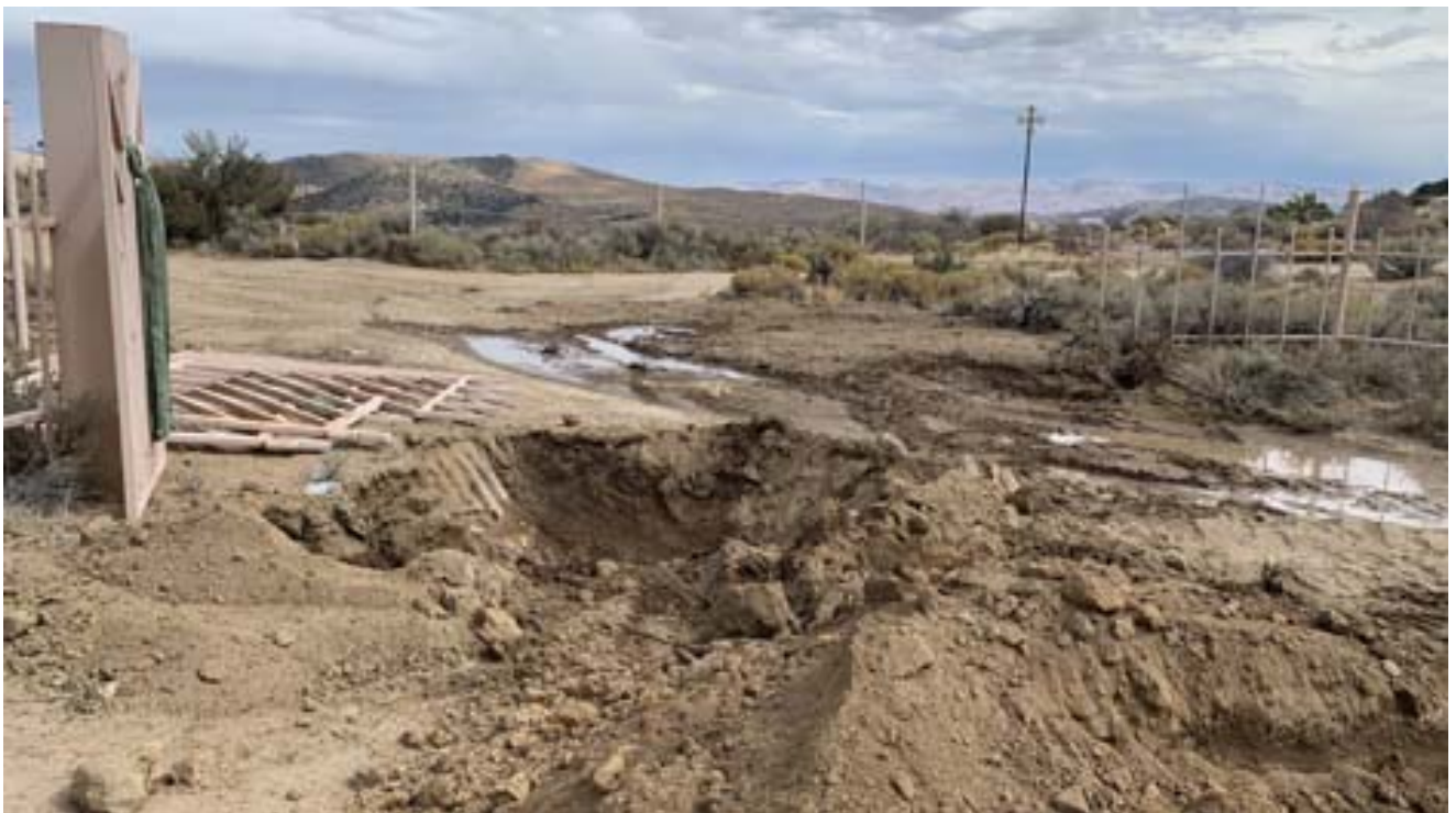
After about 5 hours of work, the Zion gate has been removed.