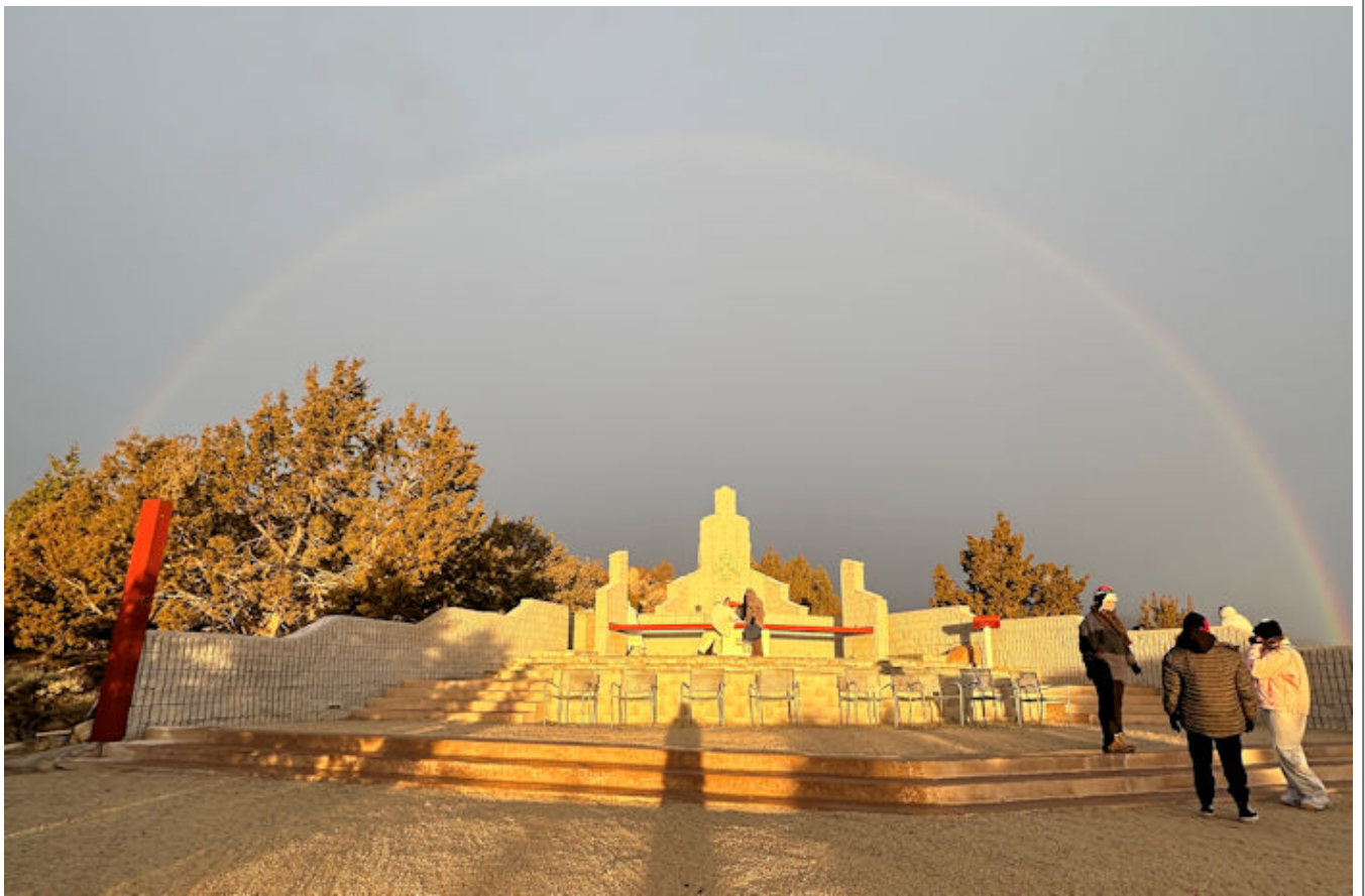
The Church of New Epiphany, where the services were held