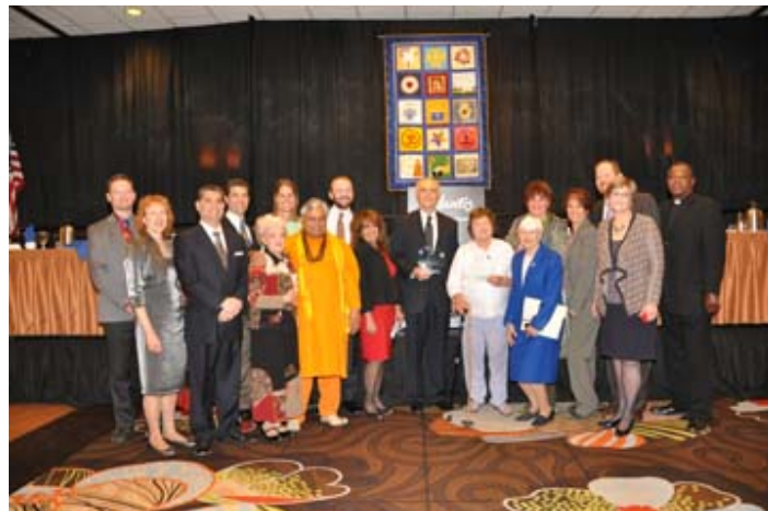
Members of the dais and award recipients

Originally known as the Governor's Prayer Breakfast, the event was held for nearly two decades in Northern Nevada until 2001. It was re-established as the Nevada Prayer Breakfast in 2010.